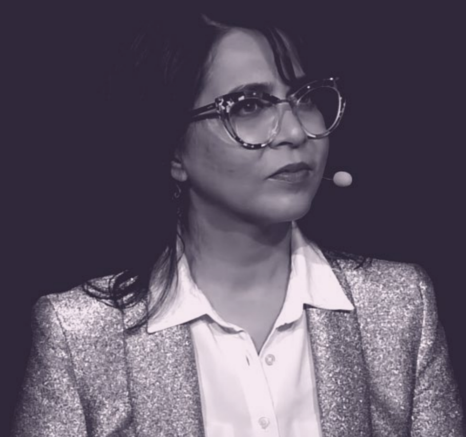
Breast Density: A Personal Biomarker Of Cancer.

"The medical community is concerned that by notifying women of their breast density and the fact that it's an independent risk factor for breast cancer, and reduces your mammographic sensitivity, we'll cause more anxiety for women. But I ask you: If density were a risk factor for prostate cancer, would we hesitate to tell men?"