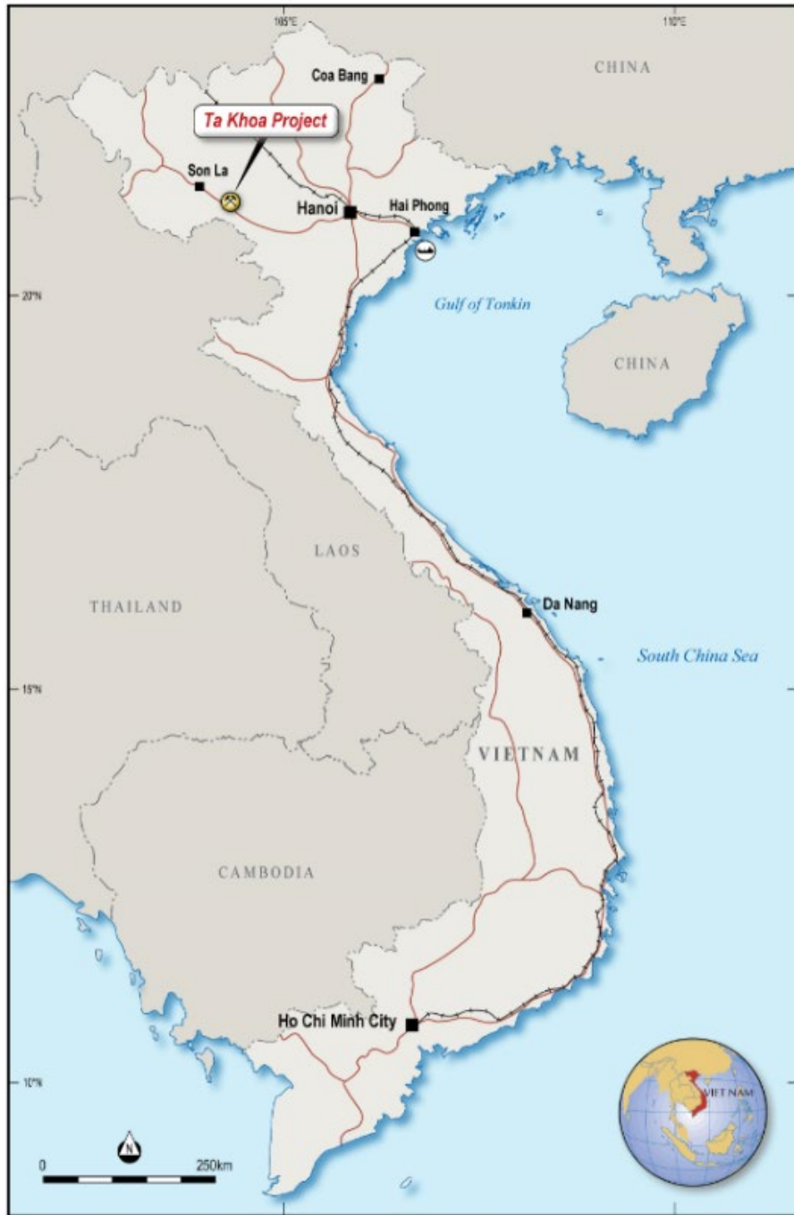
Figure 3: Ta Khoa Nickel-Cu-PGE – Project Location

The Ta Khoa Nickel-Cu-PGE Project in northern Vietnam includes an existing modern nickel mine which has been under care and maintenance since 2016 due to falling nickel prices. Existing infrastructure includes an internationally designed 450ktpa processing plant. Previous project owners focused mining and exploration efforts primarily on the MSV at Ban Phuc. Blackstone Minerals plans to explore both MSV and DSS targets throughout the project, initially within a 5km radius of the existing processing facility. Blackstone Minerals will conduct further geophysics on the MSV and DSS targets and continue its maiden drilling campaign. Online readers can click here for footage taken from our Ta Khoa Nickel-Cu-PGE Project.