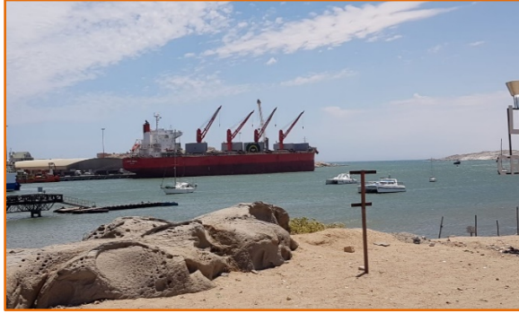
Figure 1: Port of Lüderitz, Namibia

This logistics channel will deliver cost savings over the road channel and will help diversify and manage Tshipi's overall logistics risk.