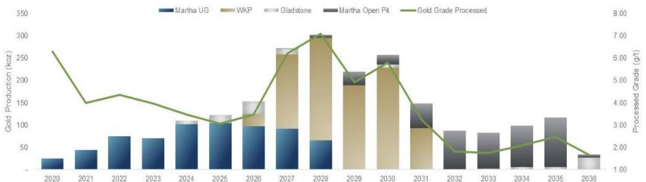
Figure 2 – Forecast Production Summary by Deposit

Average annual gold production is based on the total production expected over the initial mine life and includes the ramp-up period; thus, total gold production from the start of production until depletion of the mineral resources is assumed. Steady-state production assumes average production rates following ramp-up of mining operations. The Company will continue to drill both the Martha and WKP underground deposits with the aim of increasing the size of both resources.