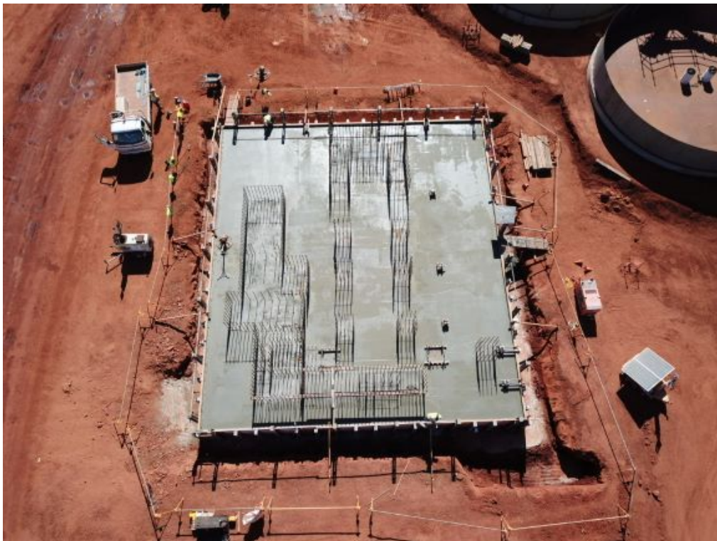
Ball mill foundations