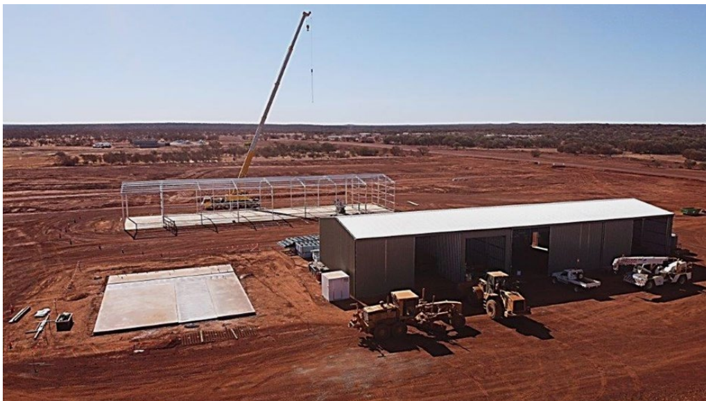
Maintenance workshop, maintenance office concrete foundation and stores shed erection