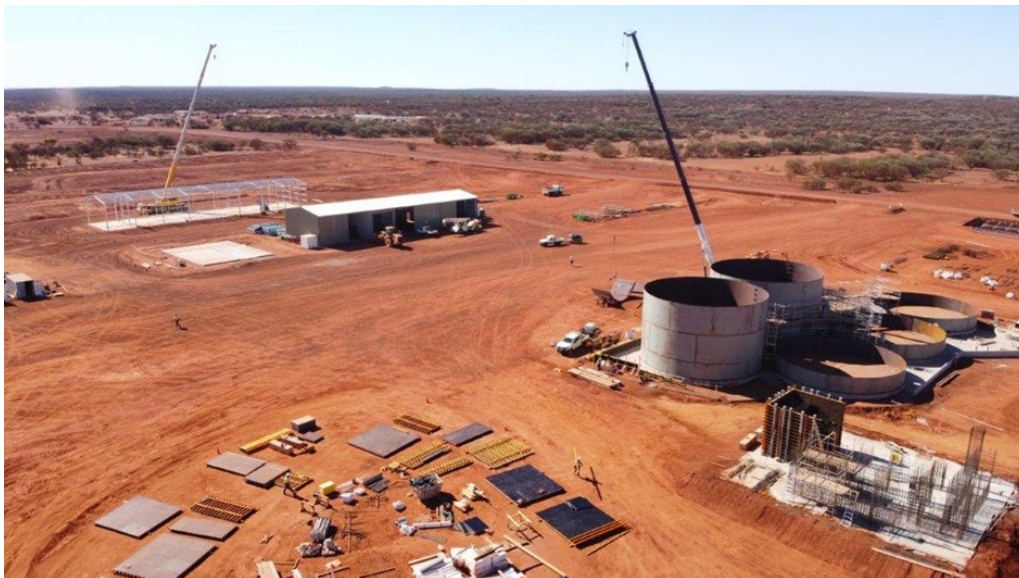
Processing plant construction progress