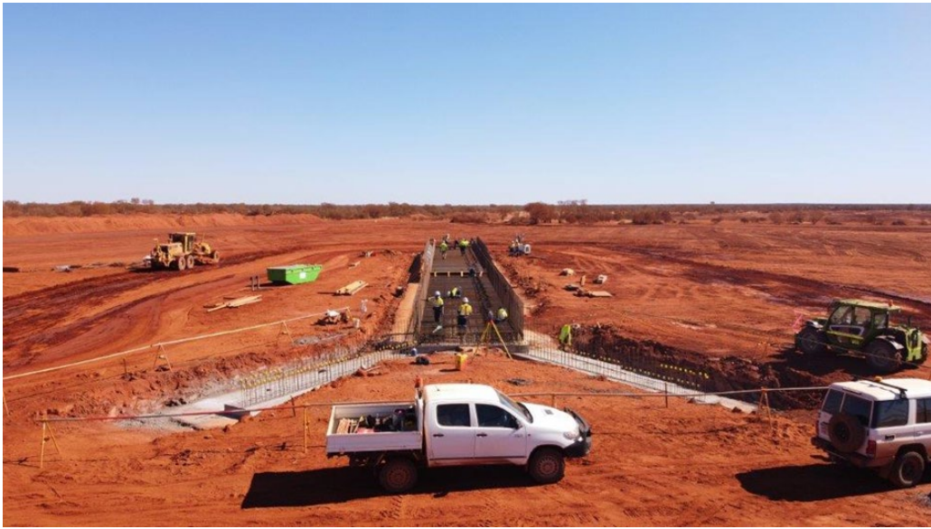
Fine ore stockpile tunnel concrete footing