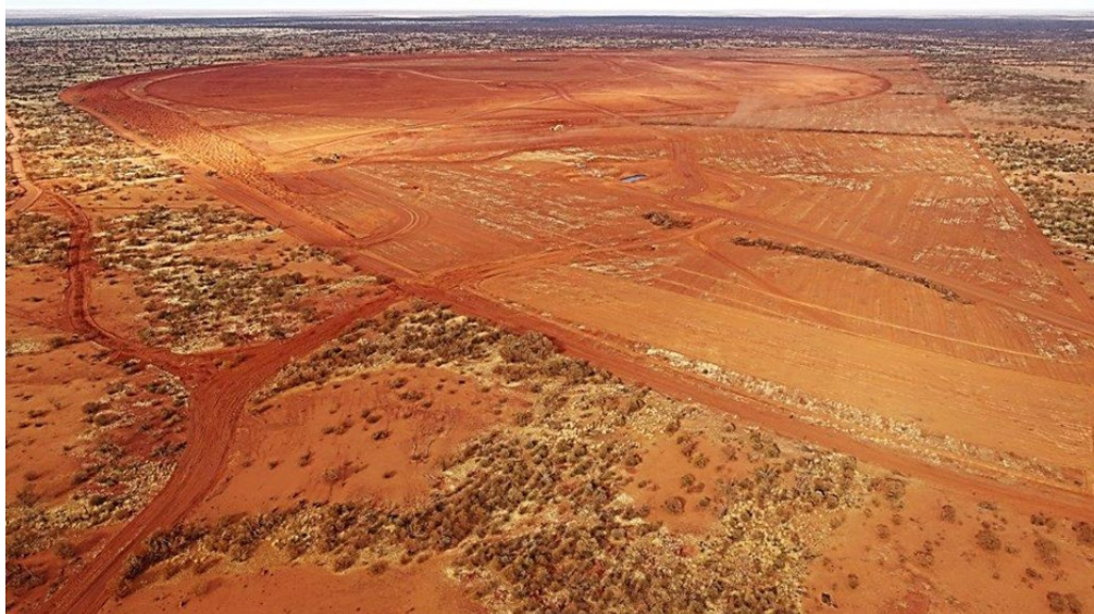
Clearing and topsoil removal for the TSF/IWL