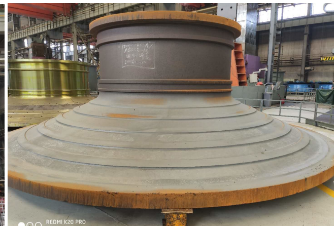
Ball mill head and girth gear manufacture