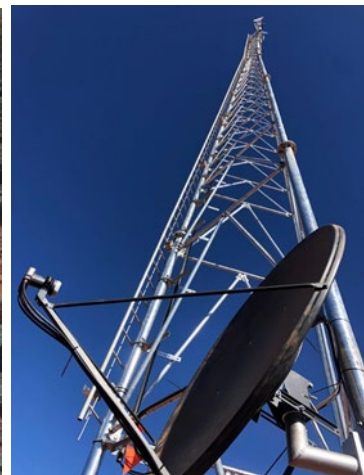
Installation of the accommodation village and communications tower