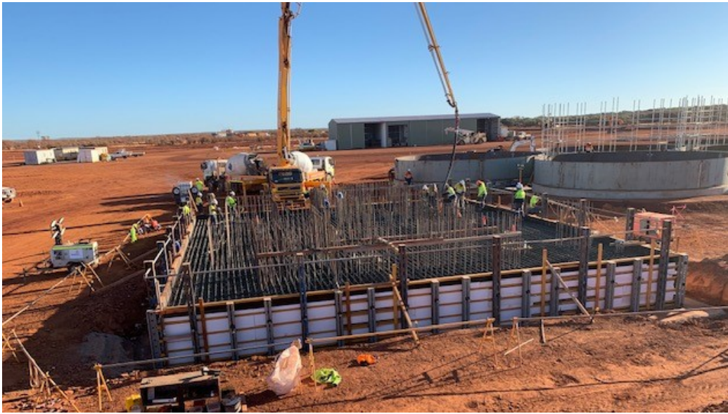
Pouring of concrete foundation for ball mill