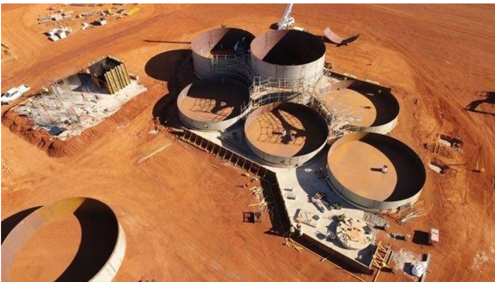
Concrete foundations for ball mill and CIL tank construction