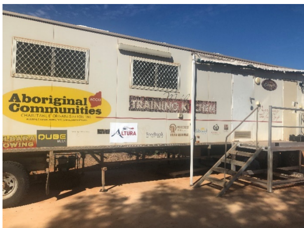
Figure 3 – Warralong and Strelley cold food storage unit and kitchen facilities

Altura also donated sporting equipment to the Strelley Community School, which with the cold food storage unit will assist with the school's existing healthy living program.