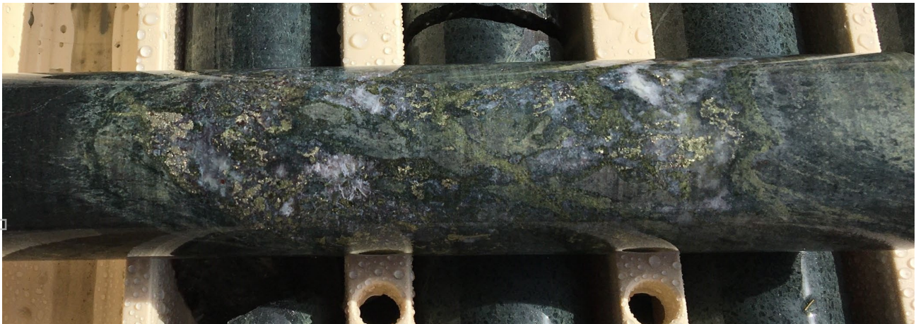
Figure 1. The best intersection of visual chalcopyrite observed in core from the mineralised zone (423m to 438m)

Alice Queen commenced its maiden drillin program at its Boda East Project in late July (ASX Announcment 27 th July 2020). The Company is pleased to report that the first hole has been completed with a visual mineralised zone intersected, confirming that the Boda host rocks extend into the Company's tenement. Alice Queen has received approval to increase its current program by up to 14 holes across this exciting 13km noth-south trend. Preparation for the second drillhole is now underway.