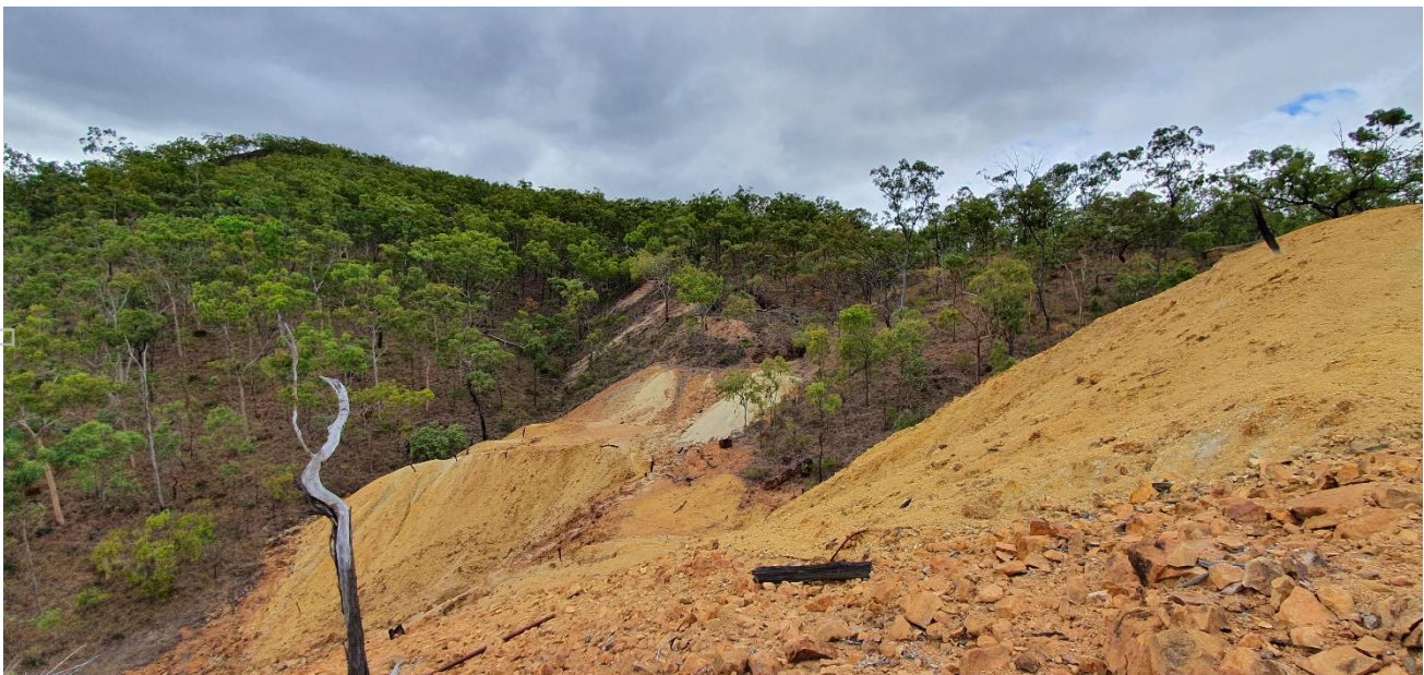
Figure 1 West Orient – Historical Workings along line of Lode

Address: Level 6, 350 Collins Street, Melbourne, VIC, 3000, Australia