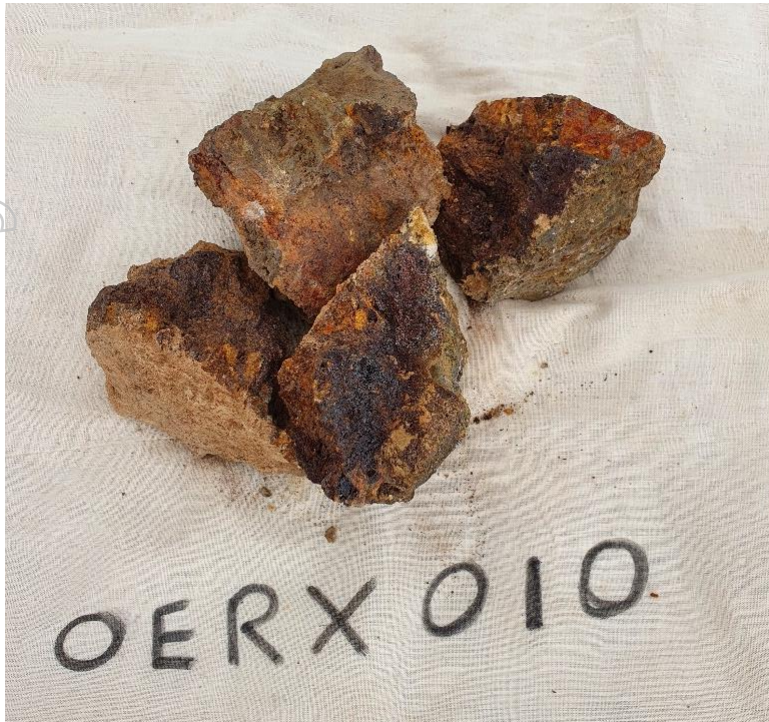
Figure 2 East Orient Sampling (OERX010) - Assay Result: 1,365g/t Ag, 403 g/t In & 25.8% Pb

The Orient Project (EPM 27223) consists of the West Orient zinc-lead-silver-indium deposit and the East Orient exploration target. The Project is located 9km north of Irvinebank in Northern Queensland. Silver-lead mineralisation was discovered in 1886 and mining activities ceased in 1924.