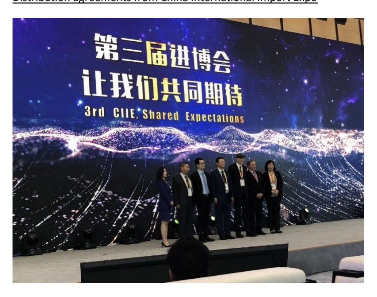
3<sup>rd</sup> CIIE signing ceremony