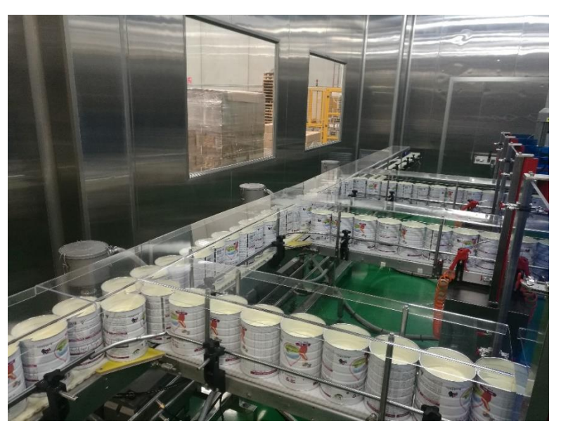
ANMA'S manufacturing facility in Derrimut, Victoria