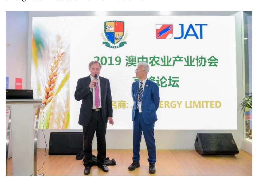
2019 China Australia Agribusiness Association forum in CIIE

JAT also signed a three-year non-exclusive distribution agreement with Kiss Kangaroo for the sale of most Neurio products through its online platform and offline channel.