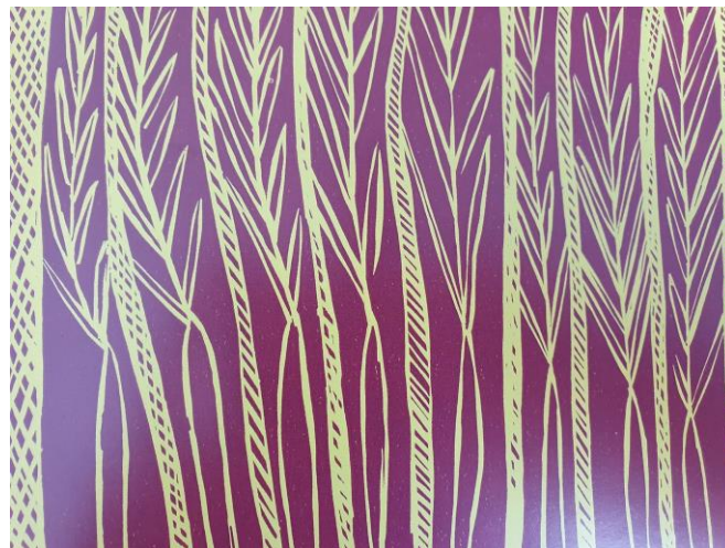
Yukuwa by Mulkup Wirrpanda (2014)

The company is also examining the possibilities of combining the resources at Bundybunna in respect to traditional bush medicines with sea cucumbers at Shark Bay for the production of new products (both supplements and cosmetics) for the Asian market