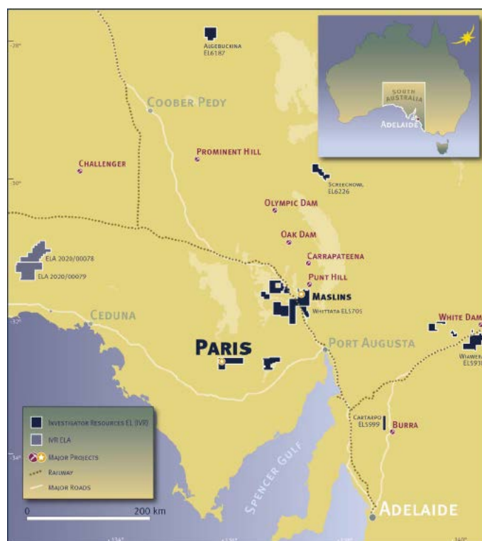
Figure 2: Investigator’s South Australian tenements

At the end of the June 2020 Quarter, application was made for 2 tenement areas within the Fowler Domain within the Western Gawler area in South Australia. Recent drilling in the Fowler Domain by others (Western Areas - ASX:WSA – 23 June 2020) has identified significant nickel and copper sulphide mineralisation immediately adjacent to these application areas.