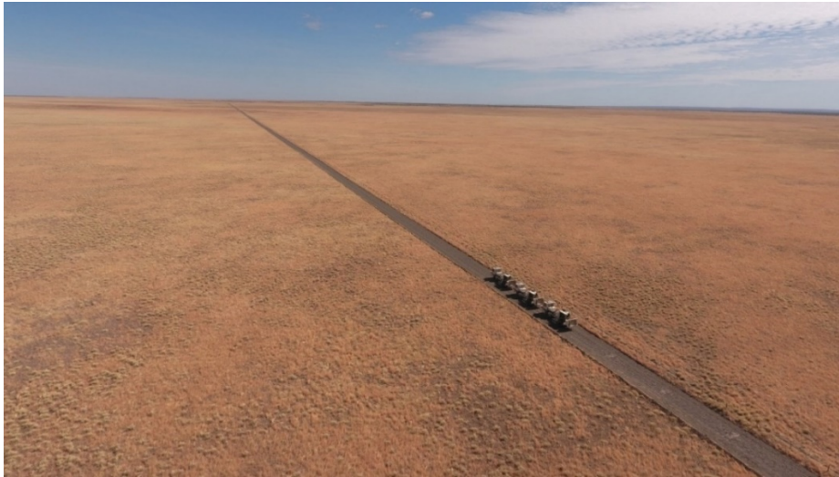
Photo 1 – Barkly Tablelands – Northern Territory

New datasets provided by Geoscience Australia (“GA”) as part of the Exploring for the Future Program provide crucial new data to open up and facilitate exploration in this covered, highly prospective and underexplored region of Australia (Photo 1).