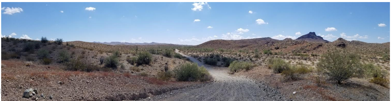
Figure 1: La Paz

La Paz Rare Earth LLC staked more than 890 hectares comprising 107 unpatented lode mining claims on federally controlled land and a prospecting permit over one section of Arizona State Trust land (259 hectares). The La Paz project was vacant ground available for mineral exploration, until La Paz Rare Earth LLC lodged lode mining claims with the Bureau of Land Management (BLM) and the prospecting permit application at the State of Arizona Land Department. Title approvals were received late September 2019 and are 100% controlled by La Paz Rare Earth LLC.