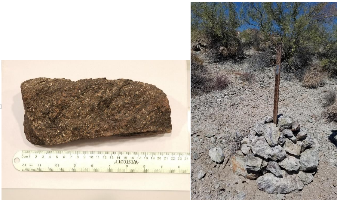
Figure 3: Sample of Augen Gneiss from La Paz

Once the review has been completed and the results validated, the Company will release to market a NI 43-101 compliant update which is expected to be completed in the second quarter 2020/21