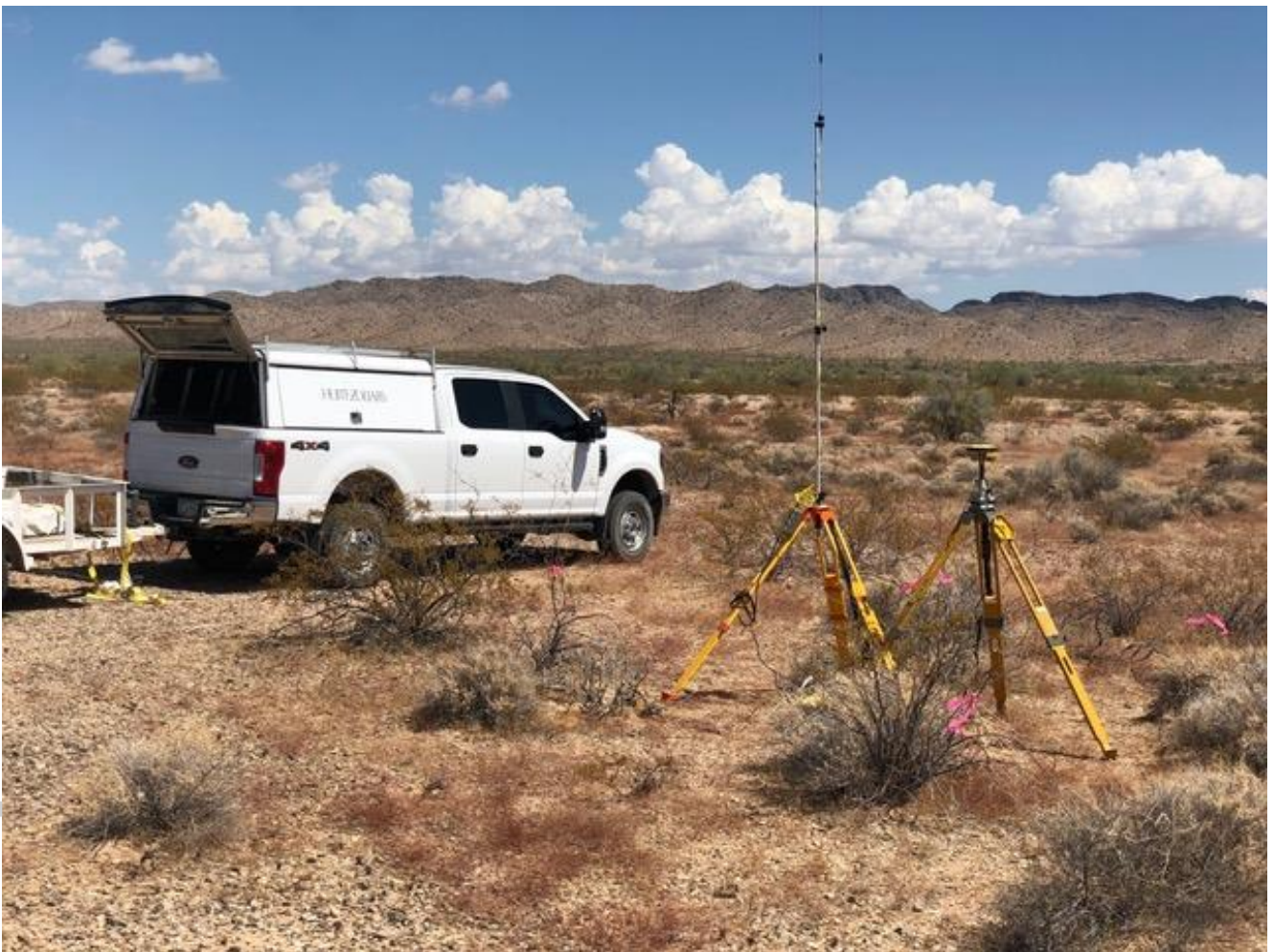
Figure 2: La Paz field work

During 2011, Australian American Mining Corporation Ltd drilled 195 percussion holes for 5,120 metres, which supported a maiden resource estimate under independent NI 43-101 guidelines. The resource displays relatively uniform distribution of total rare earth elements (TRRE) across and along strike covering a resource area 2.5 km by 1.5km. The entire deposit is exposed at surface, or lightly concealed by alluvial cover. It is open at depth and is currently defined to 30m below surface.