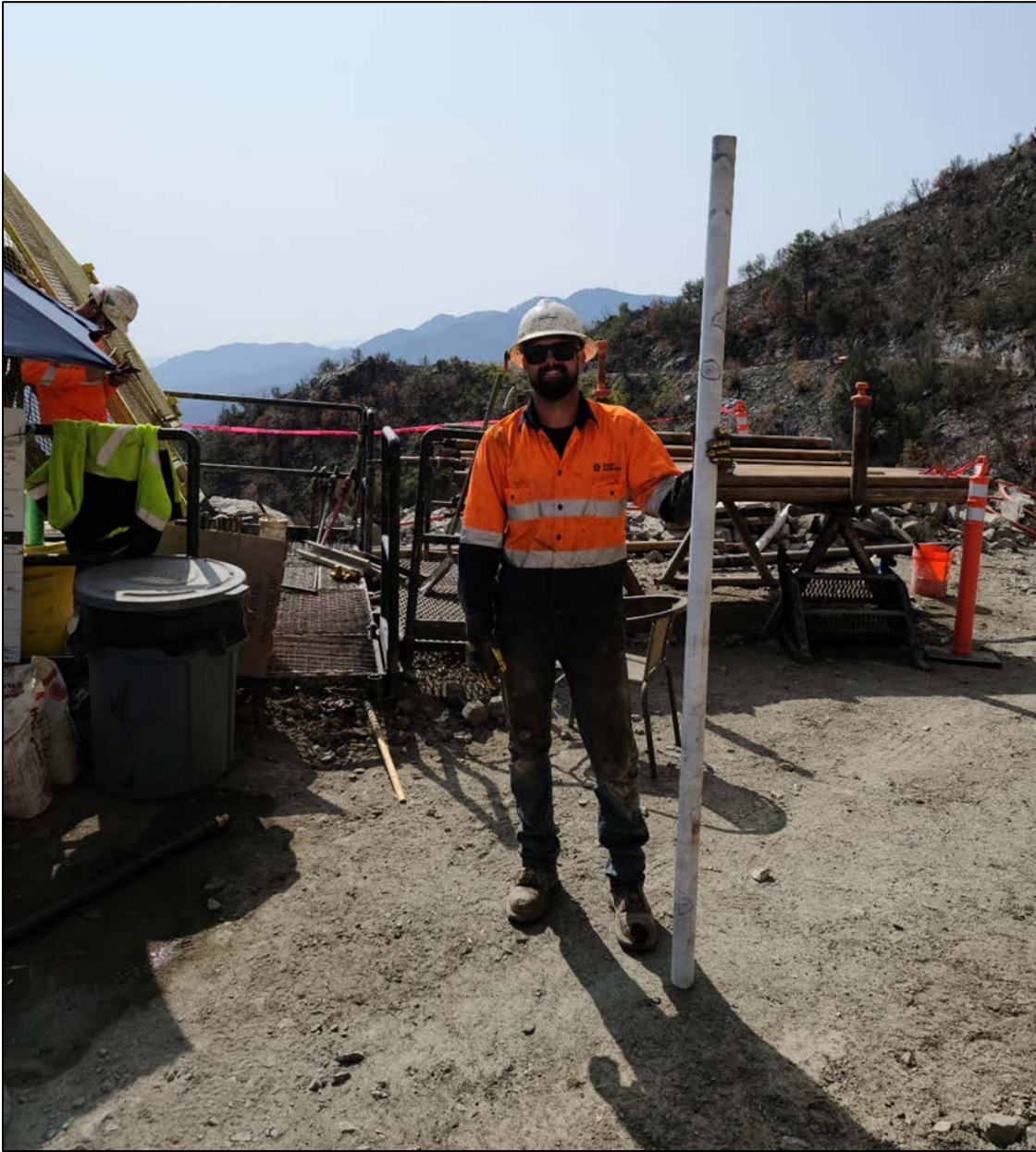
Figure 2 Happy driller: “Stick Rock” from drill hole WT-20-03.

that Eagle Mountain maintains their “A-Team” and this placement and early exercise of options will allow the Company to keep the drill rig and teams in place.