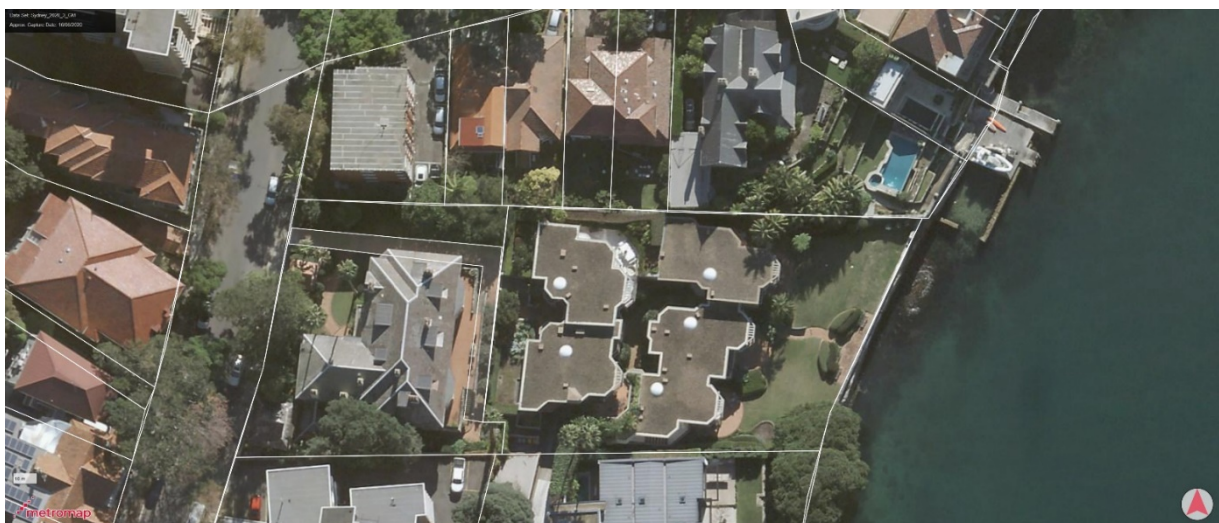
MetroMap imagery and Geoscape cadastral overlay

The total ARR value of new MetroMap contracts signed in Q1 FY21 is a minimum of $1.01m , including the PSMA and Suncorp contracts.