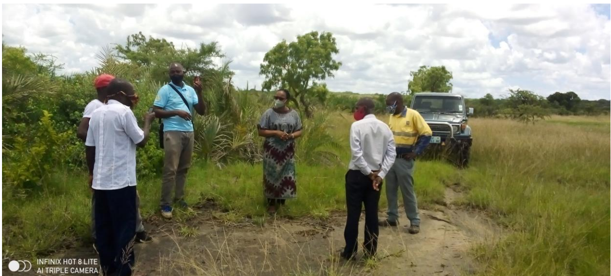
Figure 3: Local leaders undertaking a field inspection with MRG in Marao (6842L).