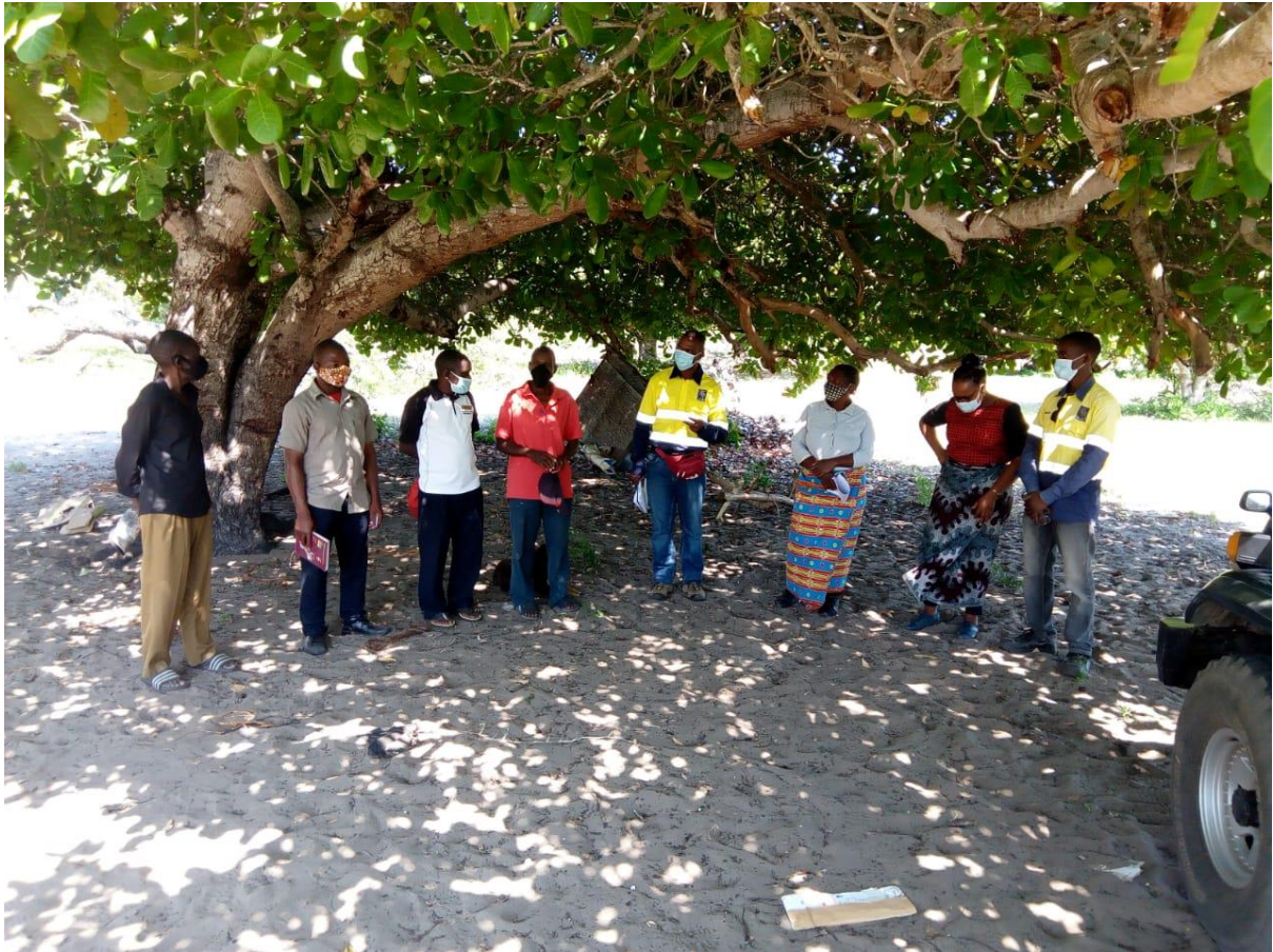
Figure 2: Provincial government representatives and community leaders meeting with MRG representatives in the Marao Exploration Licence(6842L)