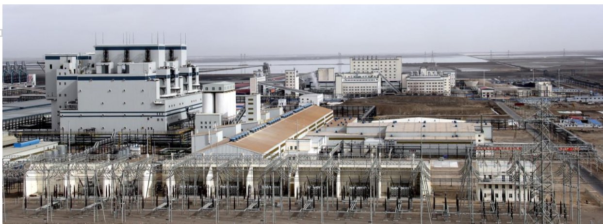
Picture: Qinghai Salt Lake Magnesium Co. Ltd electrolytic magnesium project at Golmud in Qinghai Province PRC. The Magontec Qinghai magnesium alloy cast house is part of this complex.

To view the 2021 Magontec Limited Half Year Report and for more information on Magontec Limited please visit our website at www.magontec.com