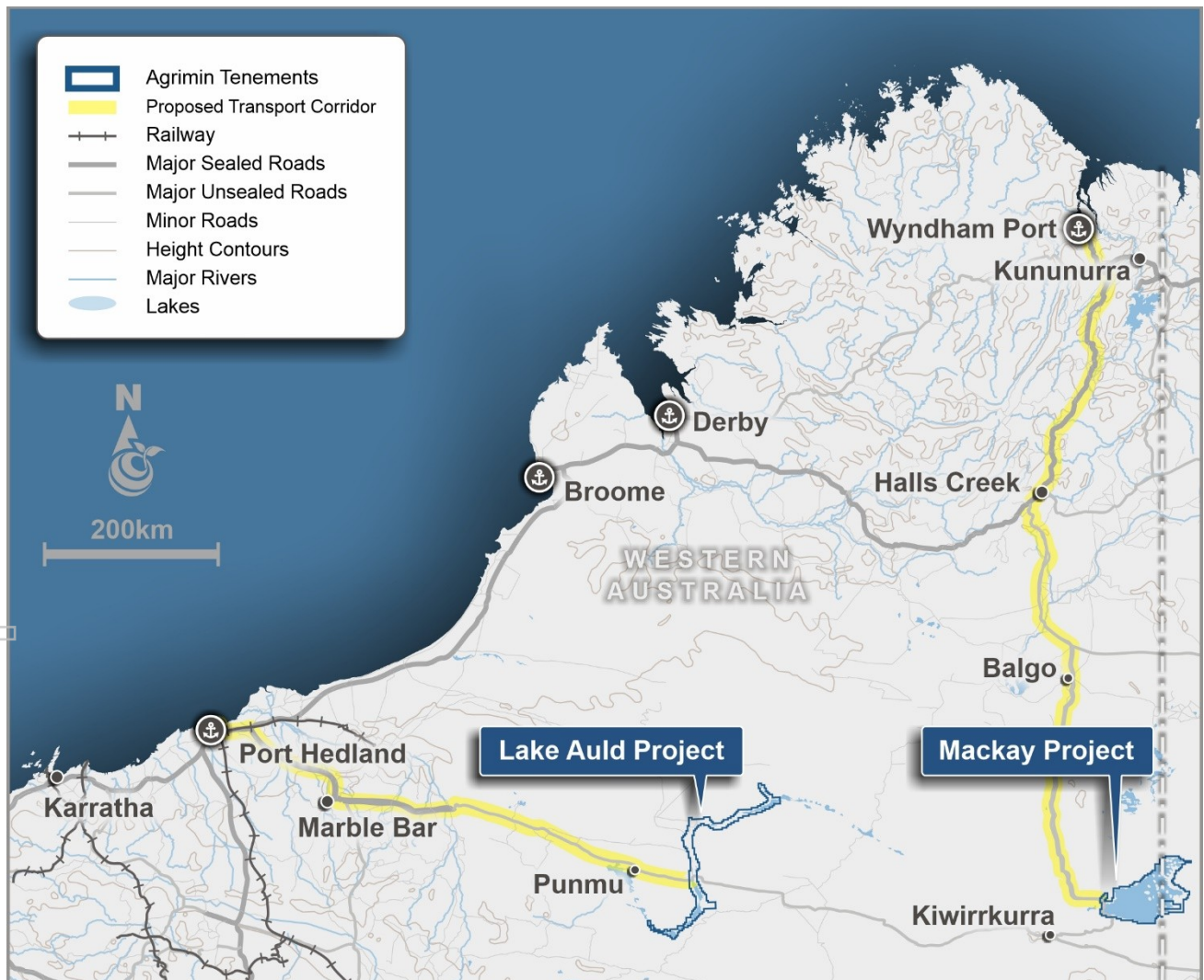
Figure 1: Map of Agrimin’s Projects

The closest community to the Project is Kiwirrkurra which is located approximately 60 kilometres south-west. A Native Title Agreement with the Kiwirrkurra People was signed in November 2017.