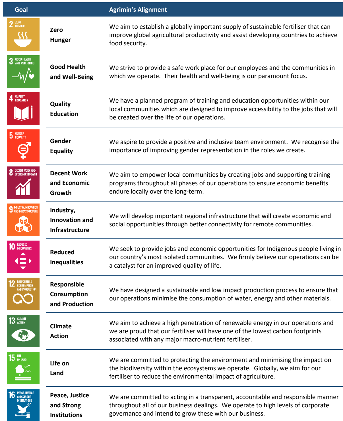
Figure 2. Alignment with the United Nations Sustainable Development Goals

Agrimin is committed to developing the Mackay Potash Project sustainably and in alignment with the United Nations Sustainable Development Goals, as outlined in Figure 2. The Company's commitment is embodied throughout the recently released DFS and has been demonstrated through seven years of positive stakeholder engagement.