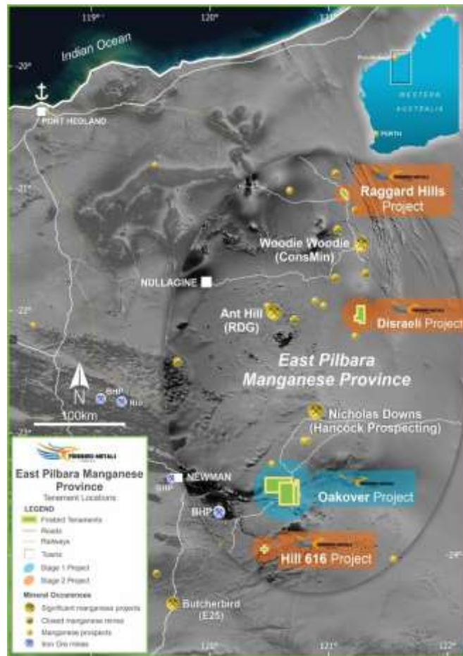
Figure 1: Project Locations

Below (Figure 1) is a map showing the Company’s project locations