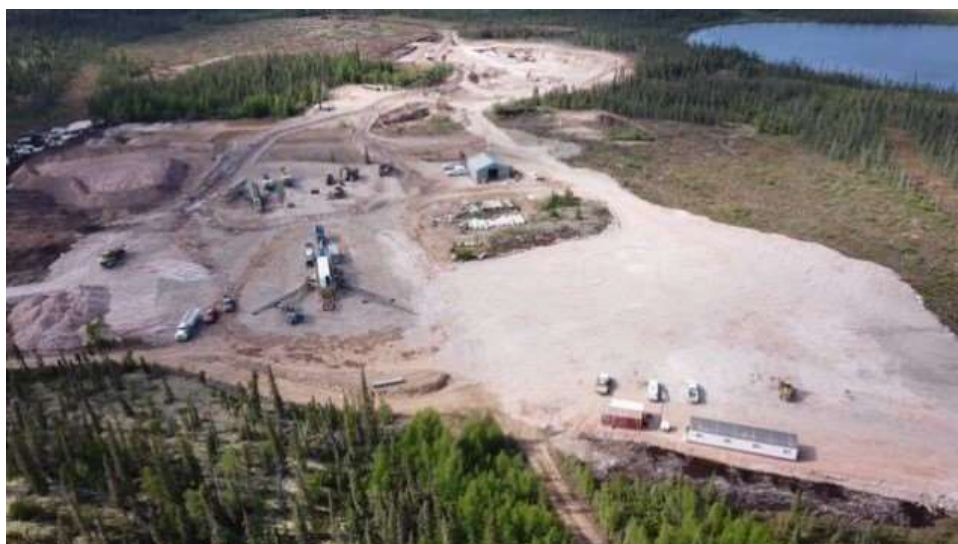
Figure 2 - Overhead image of site with ore sorter in the foreground and pit in the background

Installation of the ore sorter is complete, and commissioning occurred on 30 June 2021. Vital commenced processing ore from North T through the Nechalacho ore sorter during July as part of commissioning and training operations. Using only material from the low-grade stockpile (~2-5% TREO), the ore sorter has produced a high-grade beneficiated product from a single pass. With a target concentrate specification of above 35% TREO, a visual inspection of final product and the ratio of rare earth minerals (red bastnaesite) to waste (white quartz) indicates that the ore sorter has performed as expected. The immediate production of high-grade product, from this material, has exceeded expectations. Vital commenced processing material from the high and medium grade stockpiles in August.