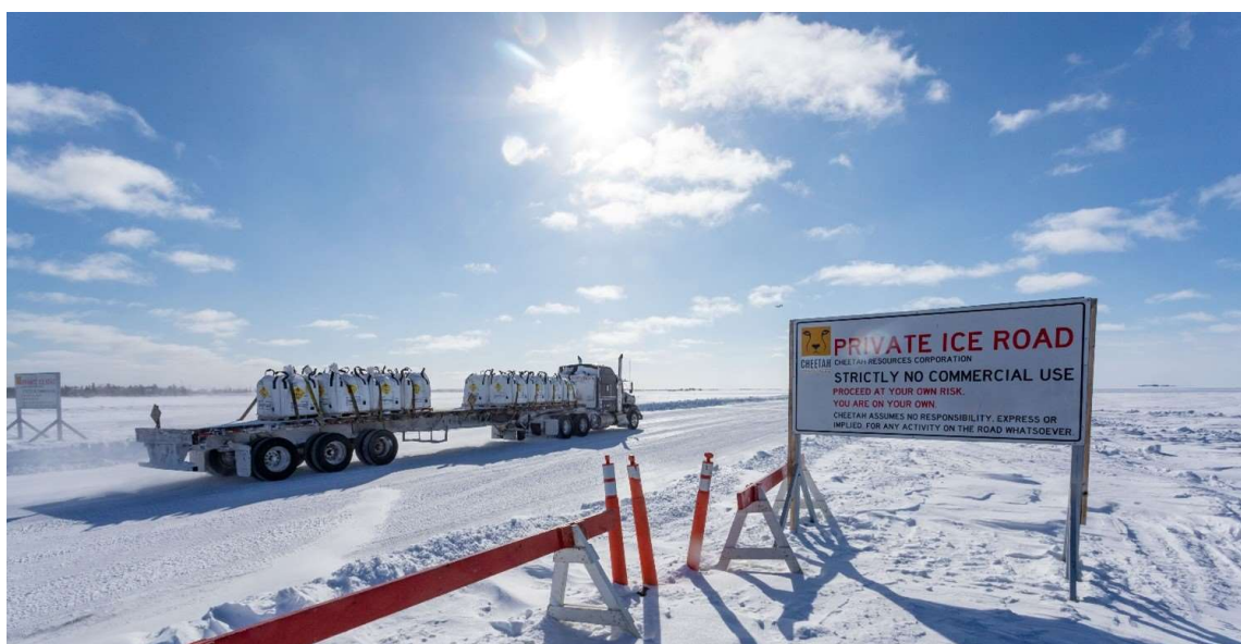
Figure 1 - Vital's private ice road to the Nechalacho project

Vital and its subsidiary Cheetah Resources Corp. held a ceremony on 20 March 2021 marking the commencement of mobilisation.