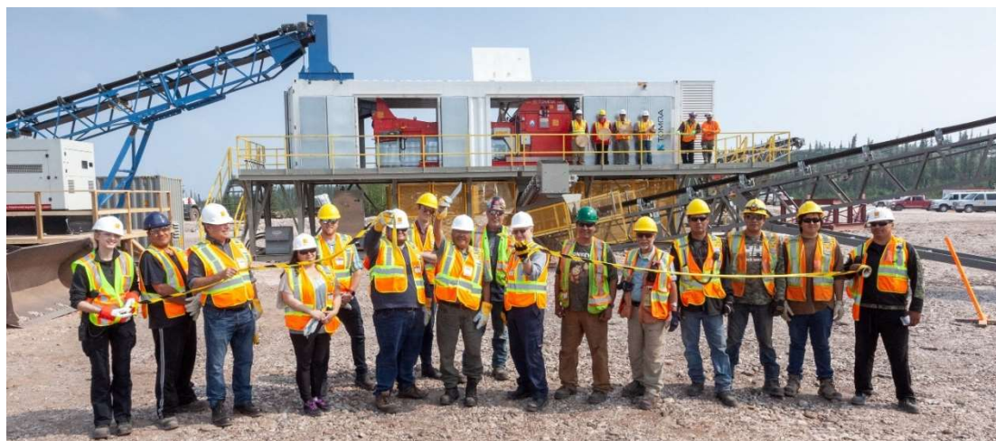
Figure 3 - Representatives of Yellowknives Dene First Nation joined in a traditional ceremony at Nechalacho

Mining at Nechalacho's North T pit has intersected high-grade REO mineralisation in the northern edge of the pit wall, which is not included in North T's existing high-grade Mineral Resource of 101,000 tonnes at 9.01% LREO (comprised of a Measured Resource of 68,000 tonnes at 9.60% LREO and an Indicated Resource of 33,000 tonnes at 7.80% LREO). 3 This new material provides potential for Vital to expand its operations in the North T pit beyond the current mine plan.