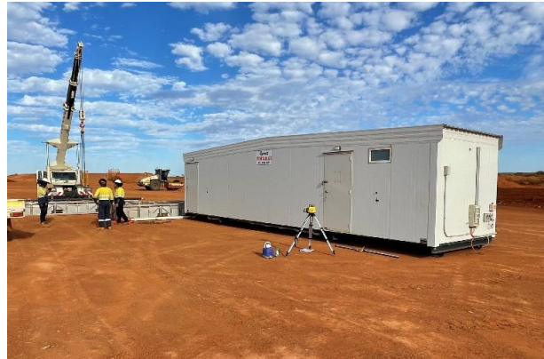
Figures 1 and 2 – GRES equipment and buildings begin arriving at Abra (photograph dated 3 November 2021).

GRES’ mobilisation for the commencement of onsite construction works is an important milestone in the fulfillment of their EPC works under the $79.5 million guaranteed maximum price contract for the supply of Abra’s 1.2 million tonne per annum lead sulphide flotation processing plant and certain associated infrastructure. It comes as their detailed engineering design works and procurement actions are now 38% and 35% complete respectively.