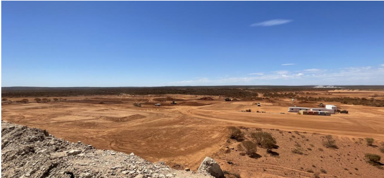
Figure 3 – Current status of Abra processing plant site earthworks (photograph dated 4 November 2021).

The Board of Directors of Galena authorised this announcement for release to the market.