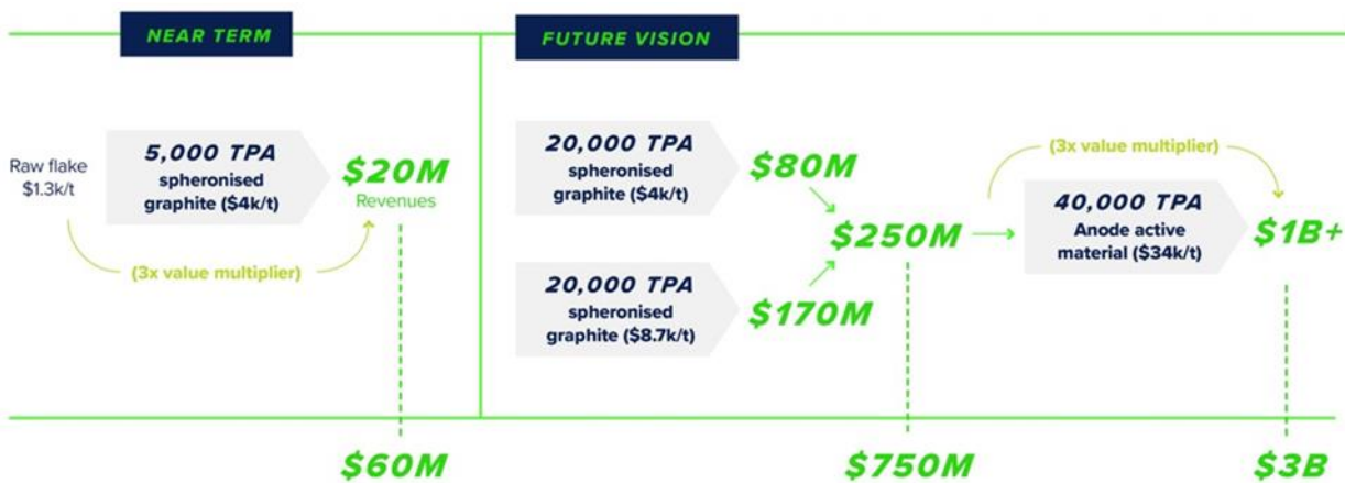
Figure after CSIRO. Dr Jerad Ford, Mission Lead, Critical Energy Metals recent webinar outlining the future vision and value multiplier of battery cell manufacturing benefit to Australia

The economic impact of developing AAM in Australia could be significant. The indirect economic benefits from battery material manufacturing in Australia is estimated to be 3 times higher than goods sold at all stages of the value chain (refer figure below).