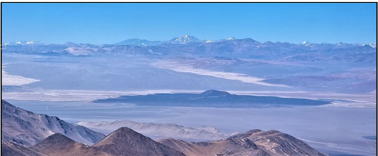
Figure 2. Image of Lake's Kachi Project, covering 30km left to right.