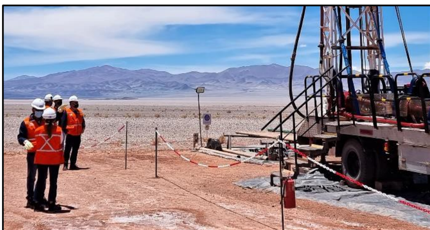
Figure 5. Water well rig at Kachi Project, assessing process water options.