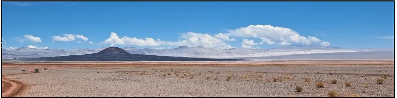
Figure 3. Image of Lake's Kachi Project, looking south, with drilling area to right of image.