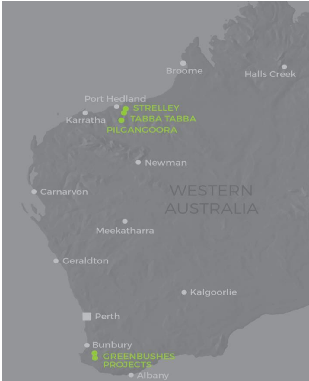
Figure 1. Location of WA Assets (detail shown in figures 2 & 3)