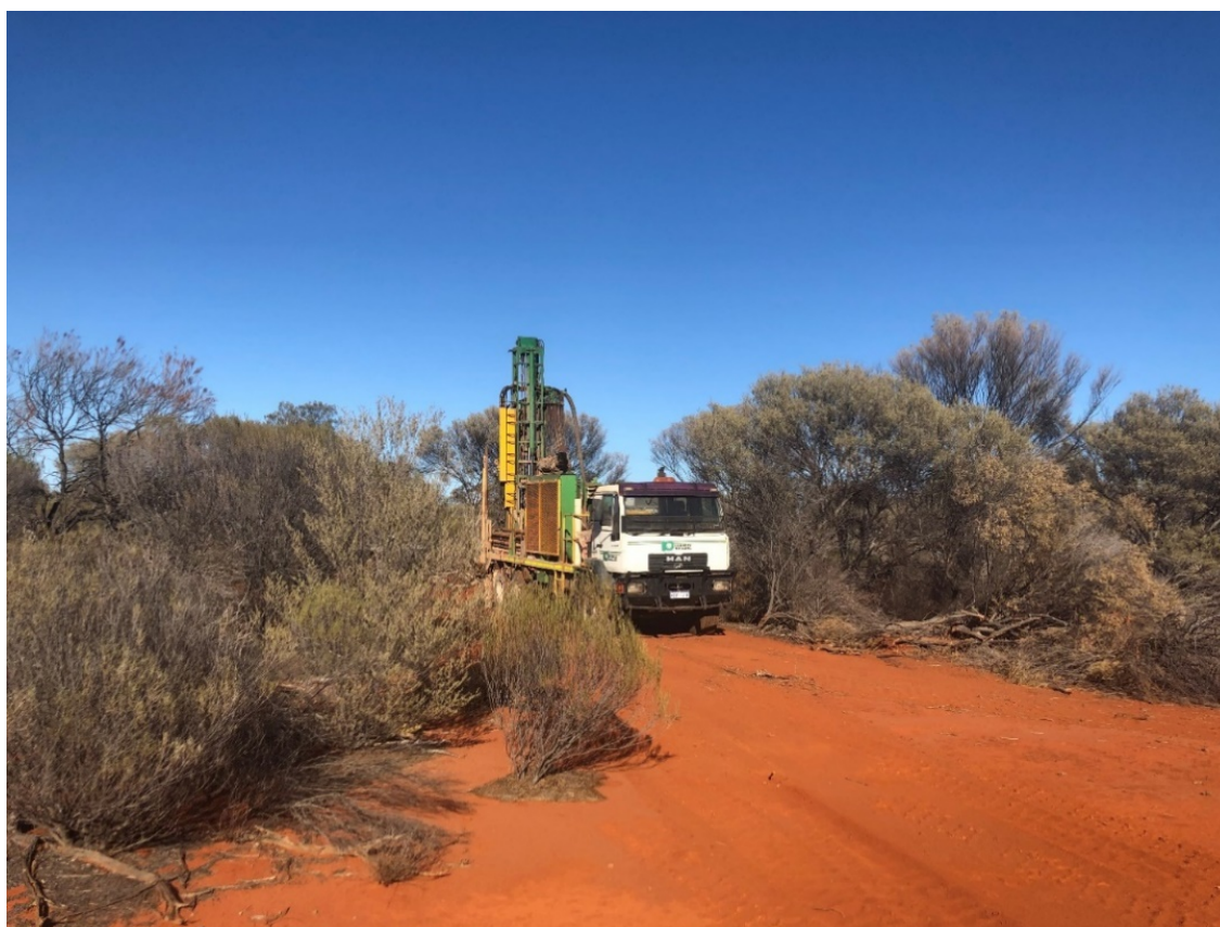
Figure 2: Aircore rig in action at Laverton South in December 2021

While assays for this part of the program are not due back until March 2022, E79 Gold is confident the lithologies and stratigraphy identified are similar to those encountered by JV partner, St Barbara, which identified anomalous gold mineralisation over a width of 300m with bedrock drillhole intercepts including 8m @ 0.35g/t Au from 70m and 4m @ 0.27g/t Au from 58m (note 1). Mineralisation remained open along strike to the south, which is the focus of current drilling by E79 Gold.