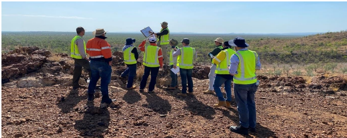
Figure 3 - Representatives from NAIF and Commercial Banks together with Boab Senior management looking out over the Sorby Hills deposit on Discovery Hill.