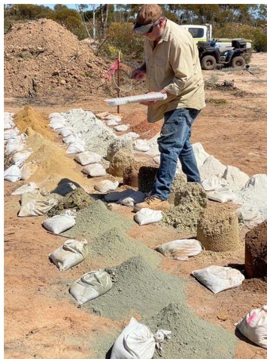
Figure 2: Recent drilling at Lady Ada

Classic will be heading back to Forresteria in late April to conduct further infill drilling if directed by independent resource geologists Cadre.