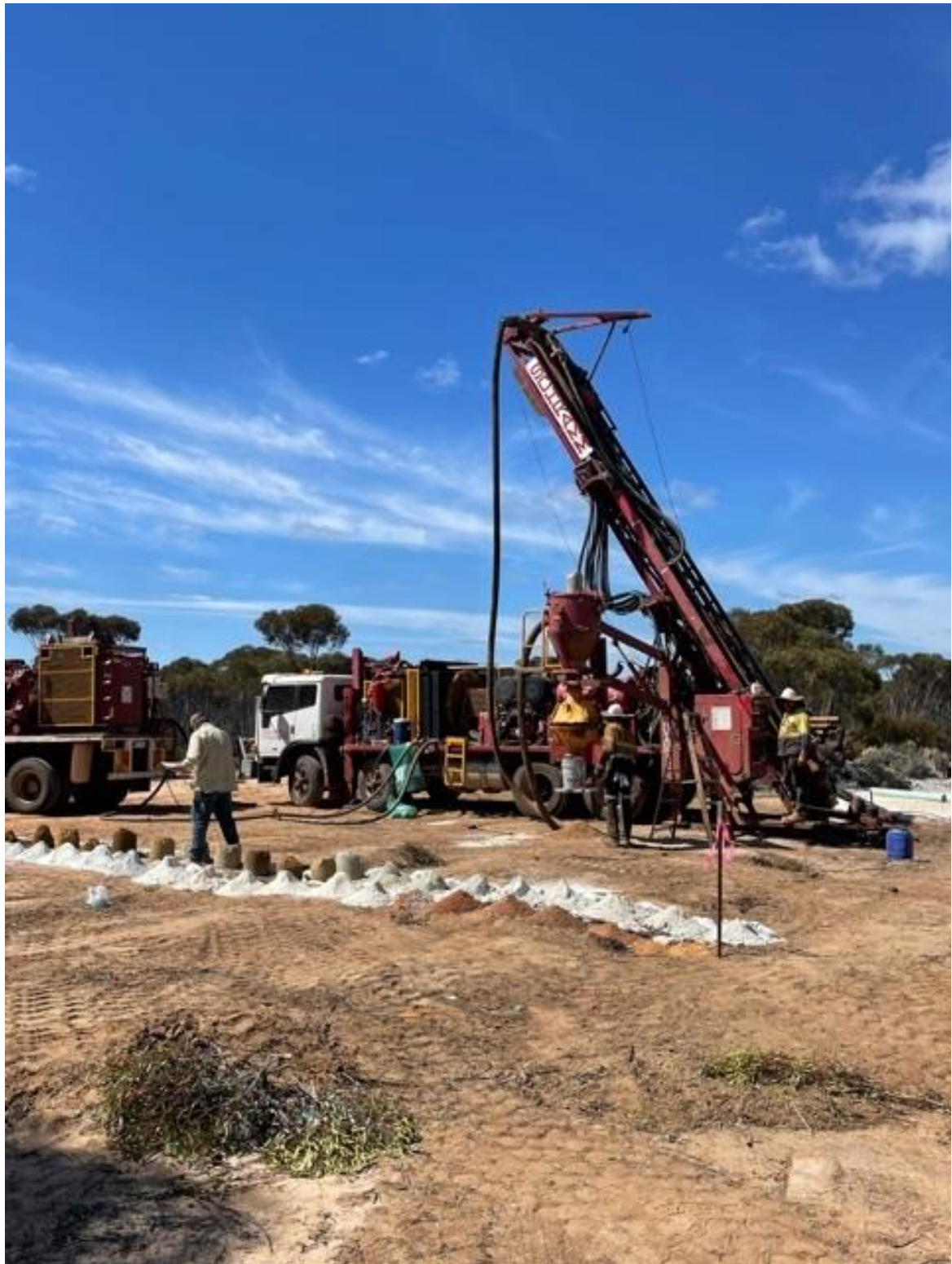
Figure 3: Recent drilling at Lady Ada