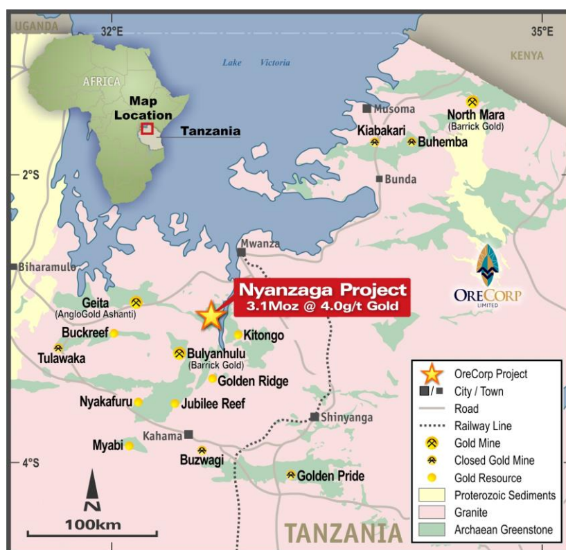
Figure 1 – Nyanzaga Project Location, Tanzania

Nyanzaga is situated in the Archean Sukumaland Greenstone Belt, part of the Lake Victoria Goldfields ( LVG ) of the Tanzanian Craton. The greenstone belts of the LVG host several large gold mines (Figure 1).