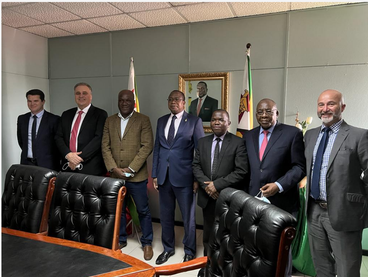
Figure 3 - Invictus & Geo Associates Boards with Hon. Mthuli Ncube Minister of Finance and Economic Development and SWFZ

"I would therefore take the opportunity to reassure our partners that as a Government we fully support the aggressive investment into the oil and gas exploration which they are carrying out and we are confident that this agreement today lays the foundation stone for a vibrant and productive oil and gas sector that will contribute to the creation of jobs, generation of exports and delivery of energy security to Zimbabwe."