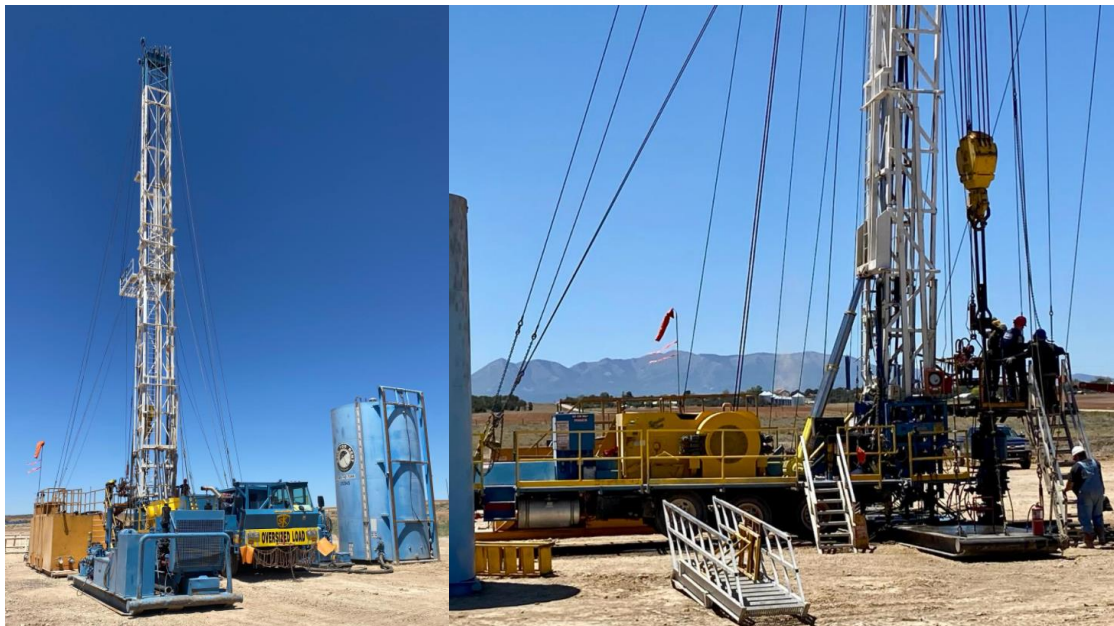
Work-over rig on the Jesse#1A well site in San Juan County, SE Utah, with the Abajo mountains in the background

As per industry standard practice, flow rates and laboratory analysis of sampled helium concentration will be the ultimate determinant of a successful commercial discovery.