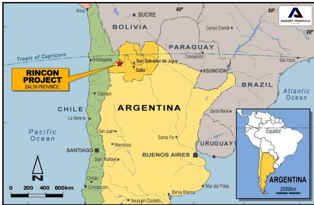
Argosy Minerals Limited – Rincon Lithium Project Location Map