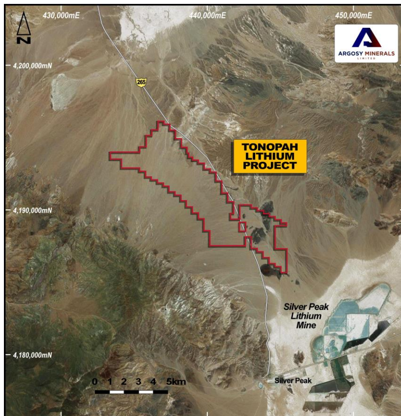
Argosy Minerals Limited – Tonopah Lithium Project Location Map

The Company considers the opportunity to develop a USA-based lithium project as a strategic position to further develop Argosy into a world-class lithium producer. Furthermore, the USA Federal Government has advised that "unprecedented action" would be taken to strengthen the USA's critical mineral supply chains, including via support for domestic resource development.