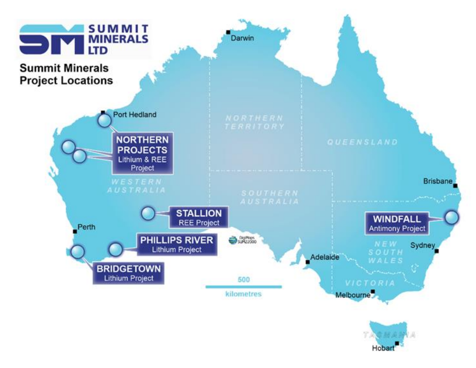
Figure 1. Summit Project locations

ACN 655 401 675 ANNUAL REPORT 30 JUNE 2022