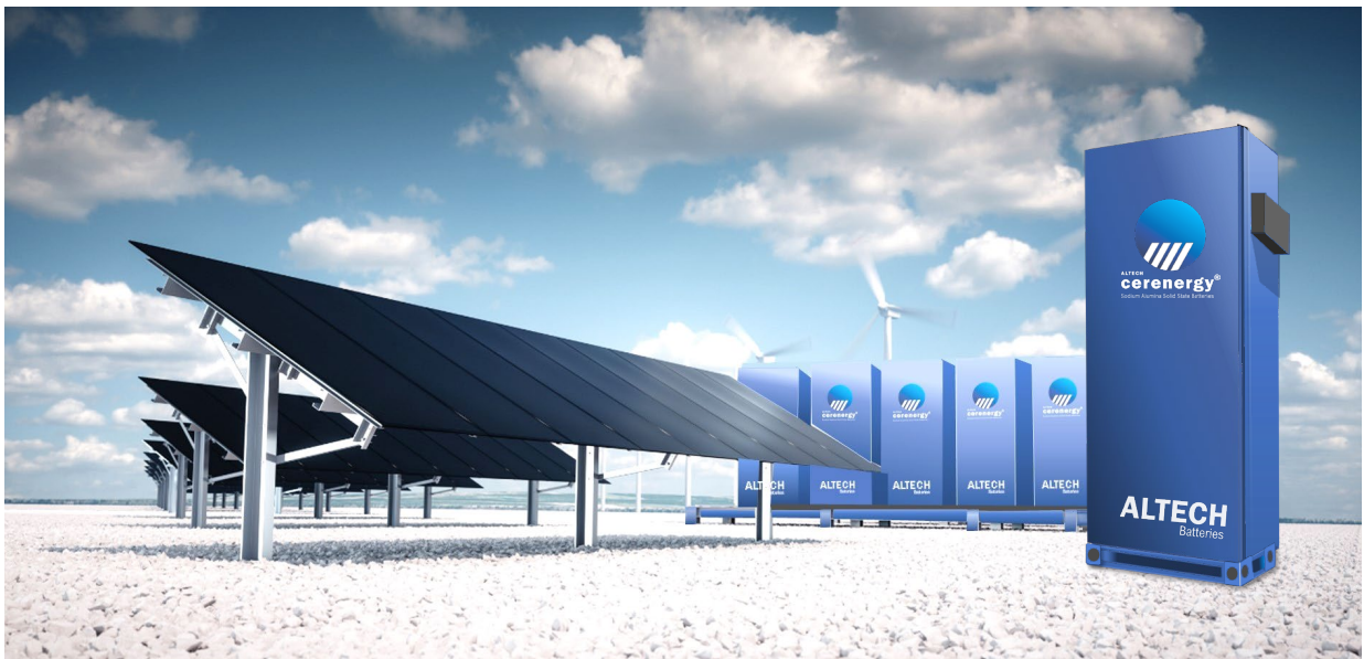
ABS60 CERENERGY® Battery Packs ideally suited for Renewable Energy Storage

Combining wind and solar with battery storage offers many advantages. The Wheatridge Renewable Energy Project in Oregon is a typical example of how combining renewable energy sources with battery storage can help provide reliable, sustainable energy as utility companies look to reduce carbon emissions. In these kind of applications, large battery systems are installed close to solar and wind farms. Typically, lithium-ion batteries have largely been used by utilities to store renewable energy when the sun sets or the wind stops blowing. However, existing utility-scale storage can only discharge energy for up to four hours at a time, meaning that systems aren't able to provide widespread power for a longer period of time (eg: over the night period). There is a need for middle and long-duration batteries that provide sustained power for longer periods.