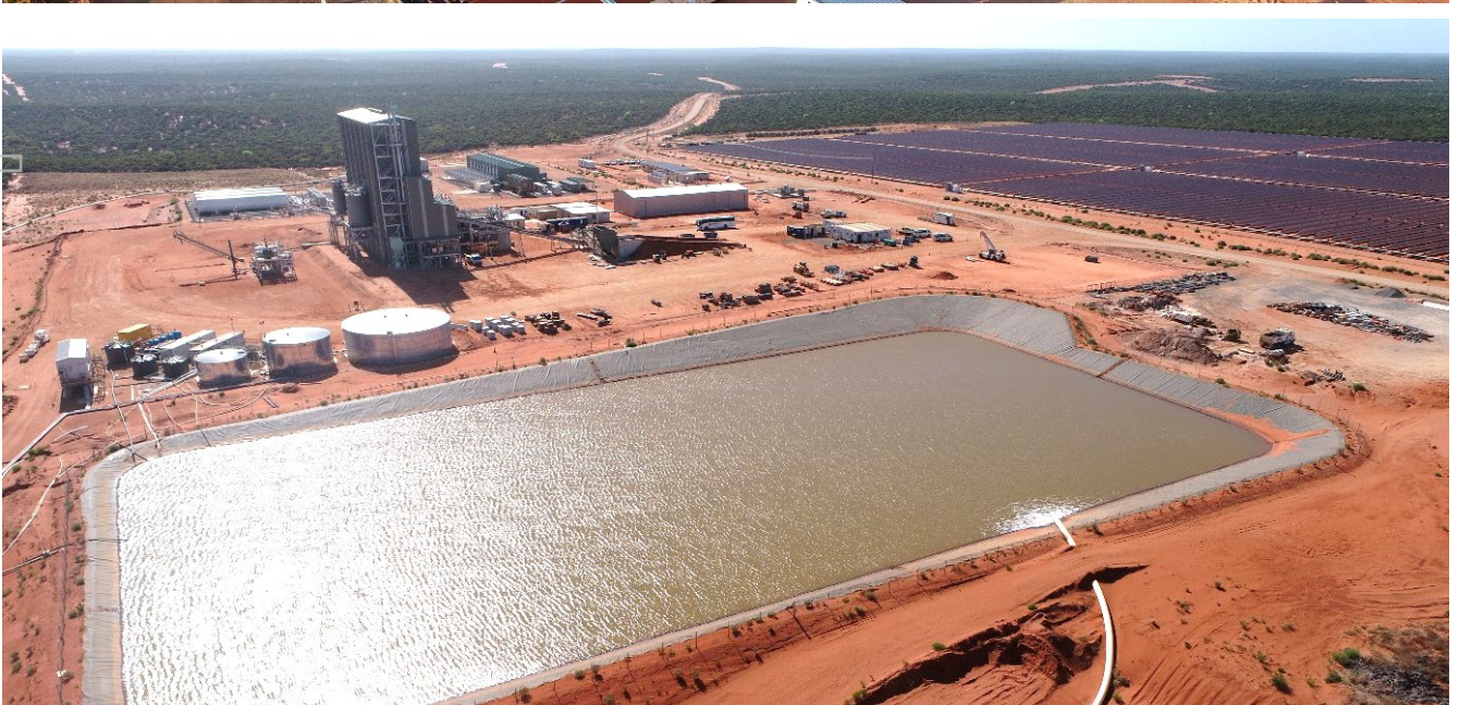
Figure 1-3 Coburn Project – Top image: Dozer Push Mining Operation. Middle image: WCP. Bottom Image: MSP