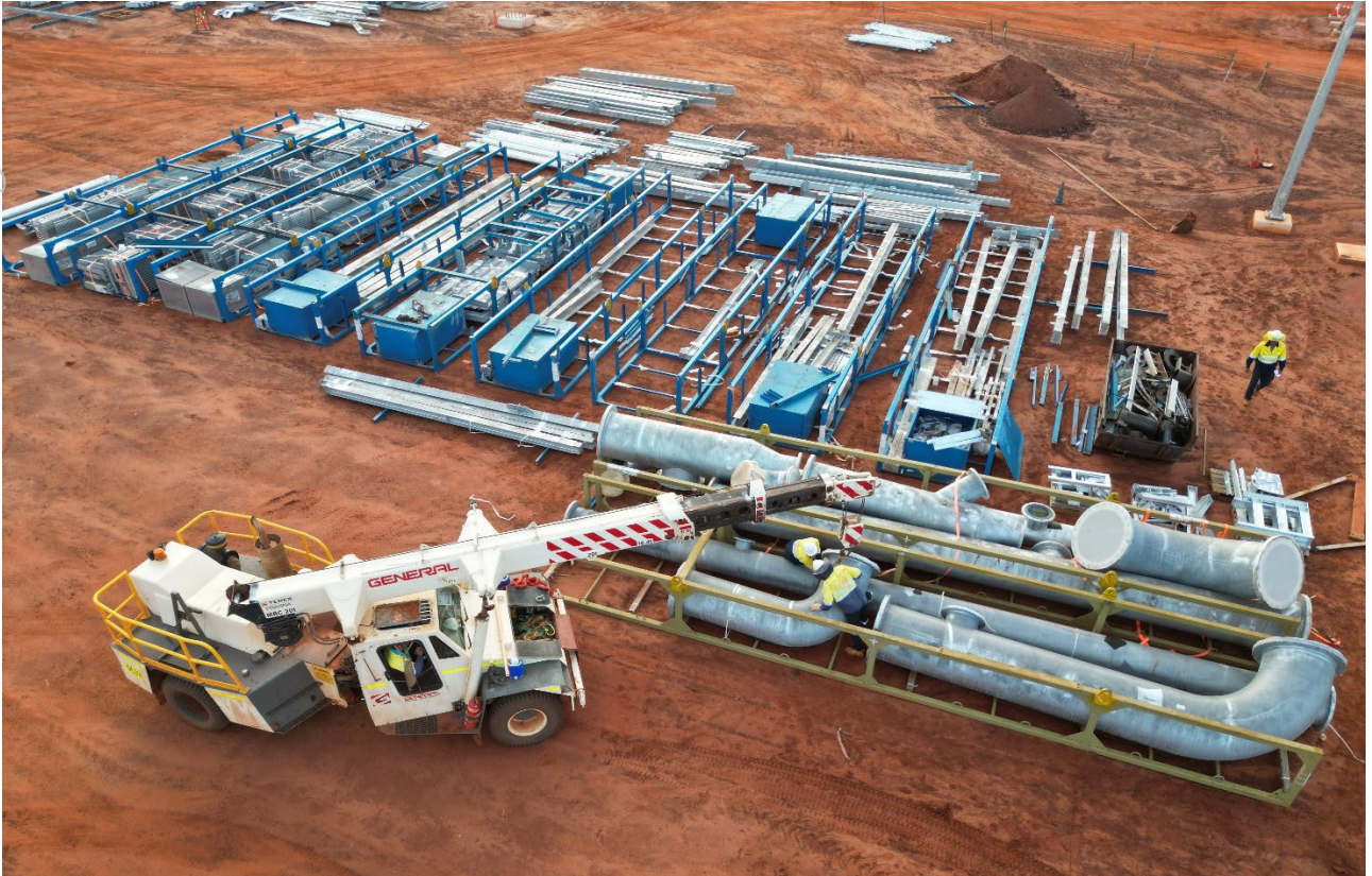
Image 6: Unpacking of steel piping and cradles at site laydown area