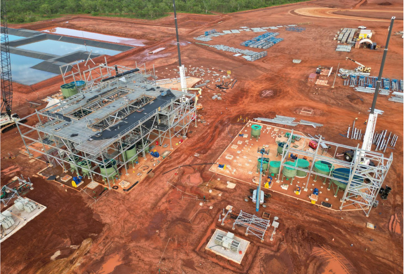
Image 2: Wet Concentrate Plant & Concentrate Upgrade Plant progress