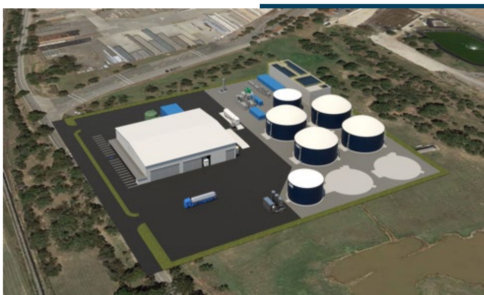
Image 8: NSW1 Bioenergy Plant Render

Progress on the Development Stage has been positive and the development work is materially on track.