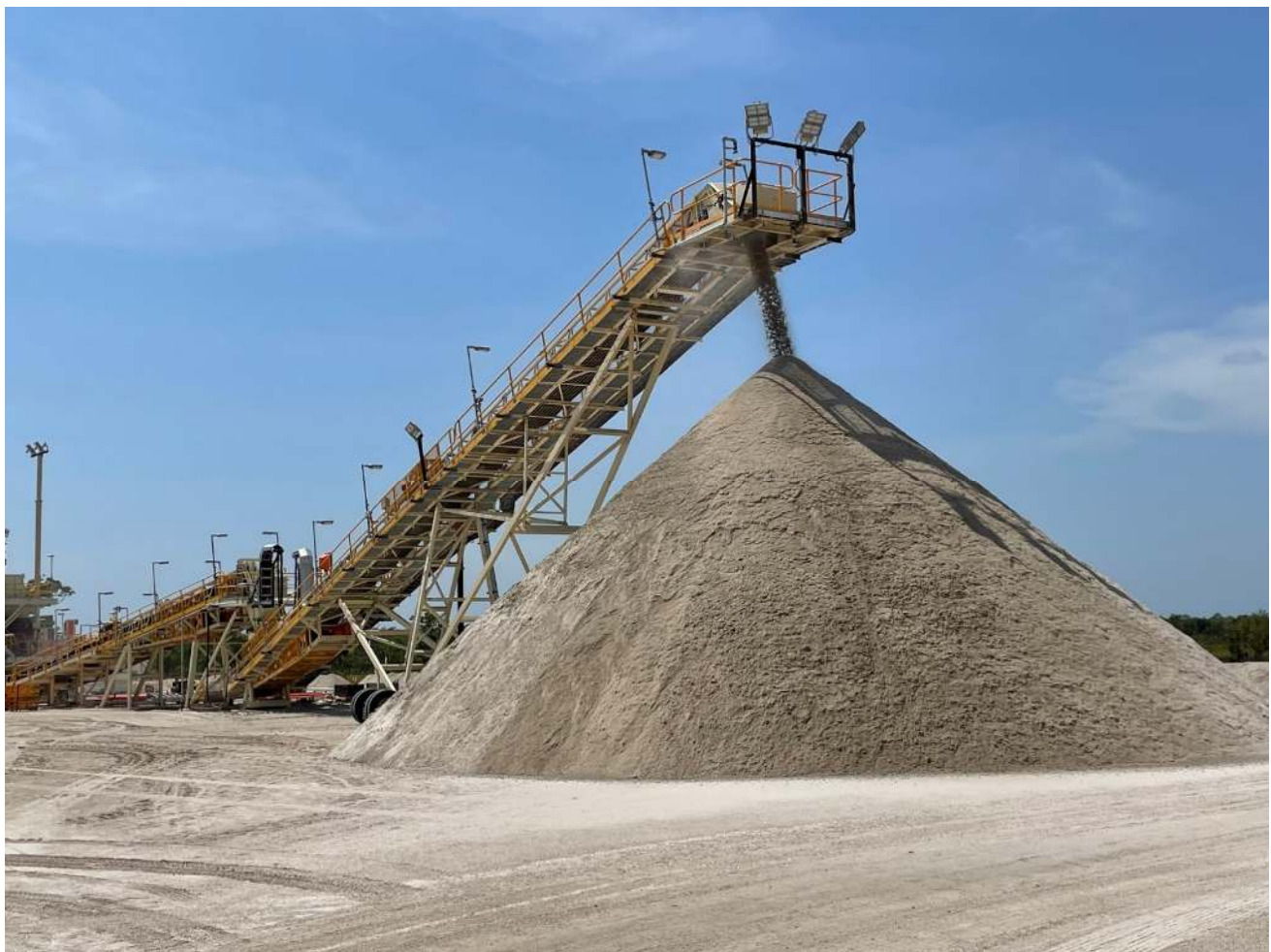
First DSO Stockpile

As at 31 December 2022 the group has outstanding contractual capital commitments of $6,786,501 (30 June 2022: $18,519,930).