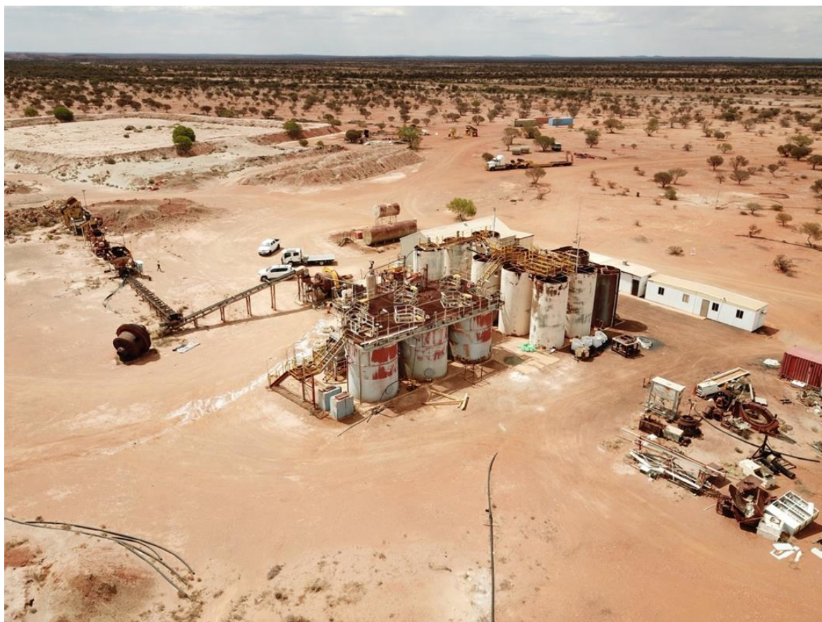
Figure 3 - Former gold CIP/CIL processing plant and TSF in the background