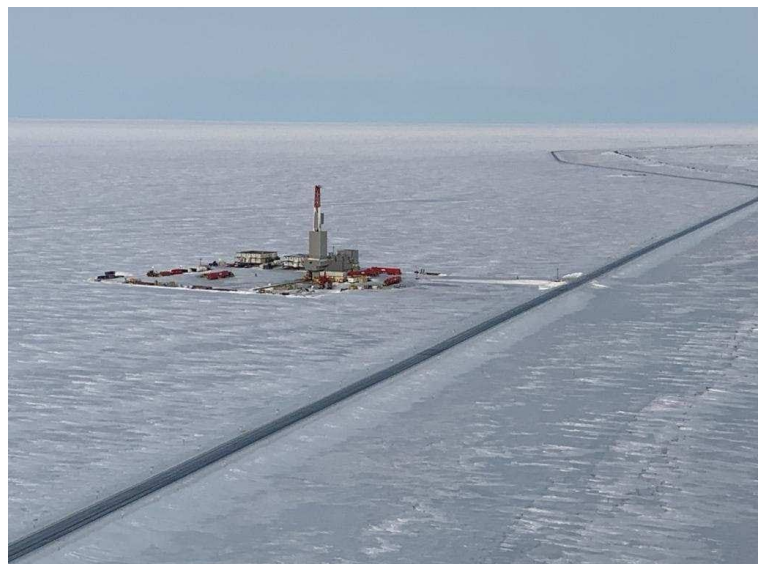
Figure 1: Nordic Calista Rig-2 at the Hickory-1 drilling location, adjacent to the Dalton Highway, North Slope Alaska.

The Company will provide further updates subsequent to Hickory-1 achieving TD.