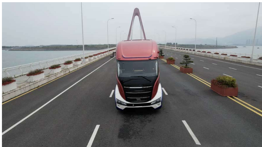
Image: Aerial drone footage of the hydrogen-powered 'Taurus' truck.

Pure Hydrogen has exclusive rights to the truck design in Australia, with the potential for multi-vehicle orders following completion of the trial period. Pure Hydrogen is also developing Australia’s first Hydrogen Powered Garbage Truck ( see ASX announcement 21 March 22 ) to be trailed by JJ Waste and Recycling, which is on track to be delivered by the end of this quarter.