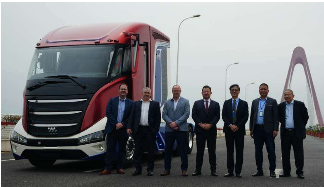
Representatives from Pure Hydrogen and HDrive with the Taurus, a 220kW 6x4 hydrogen fuel-cell Prime Mover

The Taurus is an Australian designed, a 220kW 6 x 4 Prime Mover with a hydrogen refuelling point and state-of-the-art features including a low-voltage power storage system and luxurious cabin interiors. Future designs will include Prime Movers that can handle B-Double loads of up to 70 tonnes.