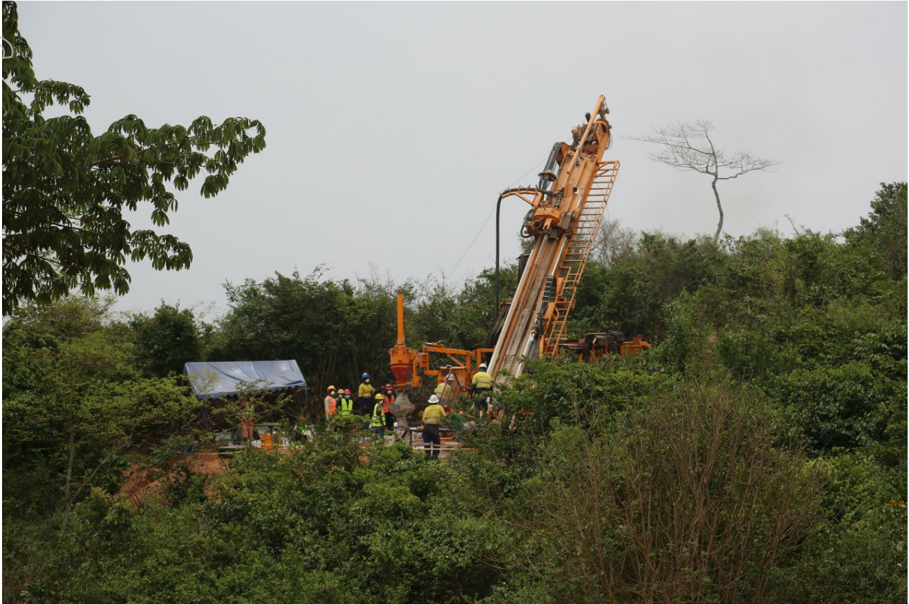
Infill drilling underway at the Ewoyaa South 2 deposit