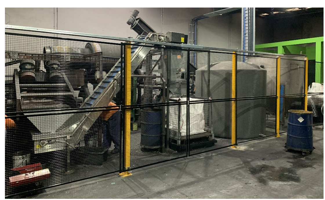
Berwick Road, Campbellfield Water Circuit Project - Wash Plant Upgrades