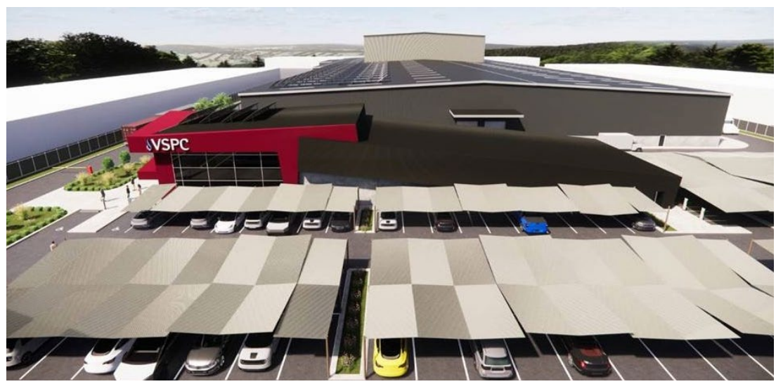
VSPC LFP Manufacturing Facility, Conceptual View