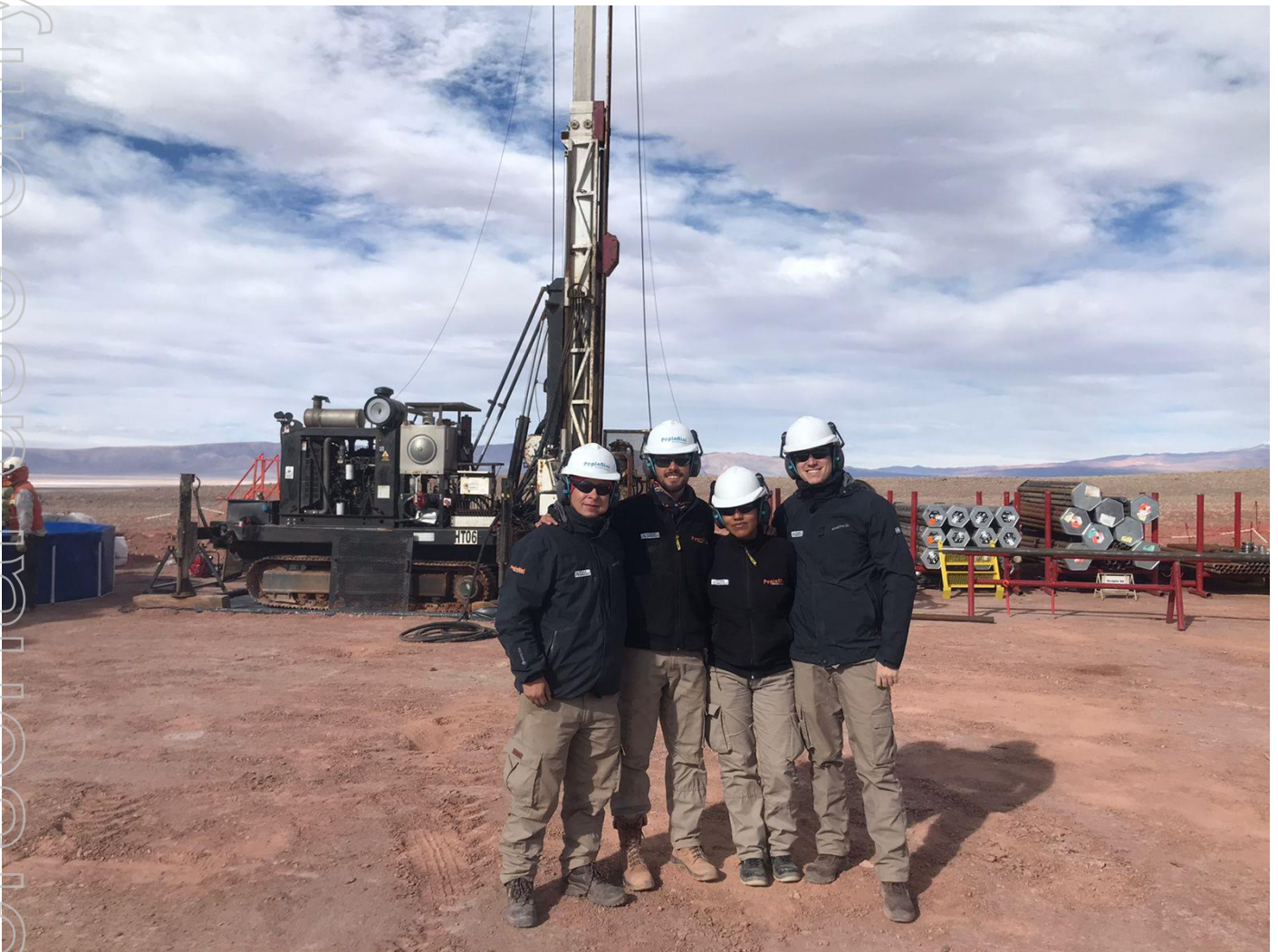
Figure 3: Drill team on site at Rincon salar, Salta Lithium Project, Argentina.