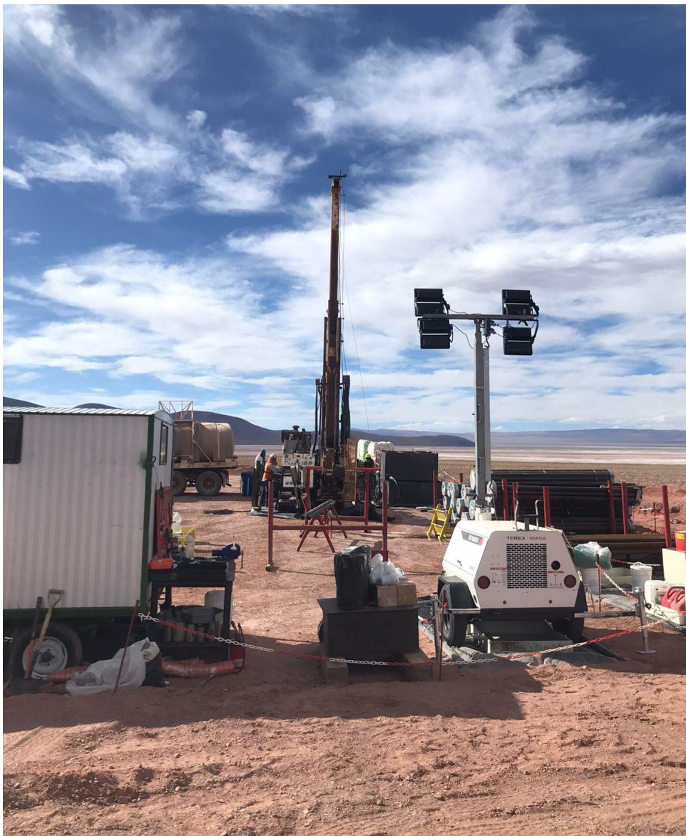
Figure 2: Drill site at Rincon salar, Salta Lithium Project, Argentina.