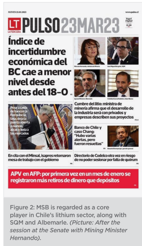
Figure 2: MSB is regarded as a core player in Chile's lithium sector, along with SQM and Albemarle. (Picture: After the session at the Senate with Mining Minister Hernando).

The Policy does not constitute a nationalisation of the lithium industry in Chile. Its objective, as clarified by the Mining Minister, is to set the conditions and parameters for the country to have a more active involvement and higher financial returns in a strategic industry, particularly where those lithium resources are located on concessions already owned by the Chilean State on the Atacama Salar. The NLP also seeks to accelerate the development of new projects in the country.