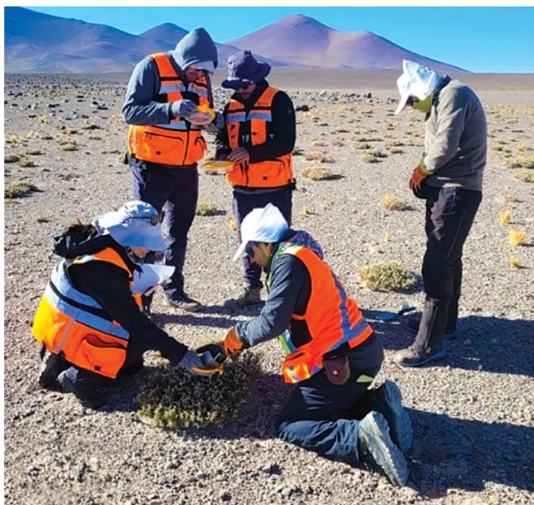
Figure 5: The MSB team, along with local indigenous people, have been collecting seeds for transplantation before construction commences.