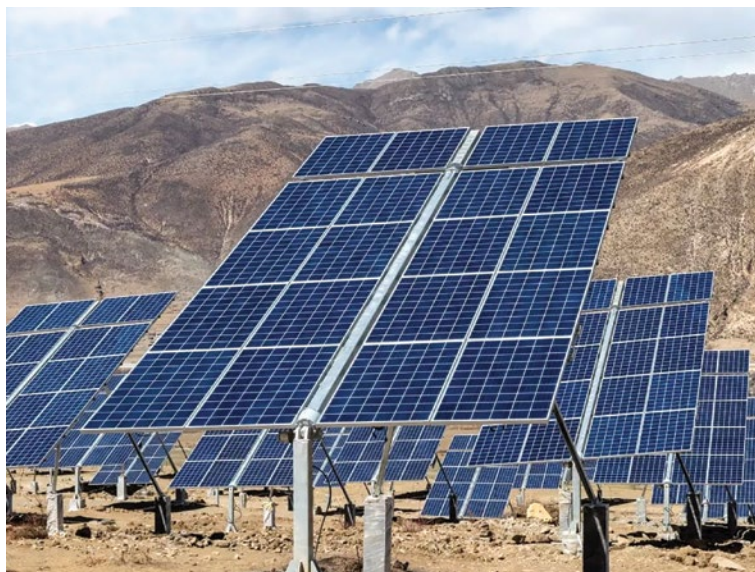
Figure 4: A solar generation project is being evaluated on indigenous community land to complement, and later replace, other energy supplies to the Maricunga project.

Ten holes for a total of 573 metres of RC drilling were completed along existing tracks. The majority of the RC holes were completed to 54m. Four holes, for a total of 360m metres of diamond core, were completed along existing tracks. Three holes were drilled to 100m, and one hole was drilled to 60m. All work was completed safely and in accordance with the strict environmental and dieback hygiene protocols as outlined in the Conservation Management Plan. All sites were rehabilitated on completion of drilling, but the holes remain accessible for further surveying or re-entry as required, pending thin section petrography and RC assay results.