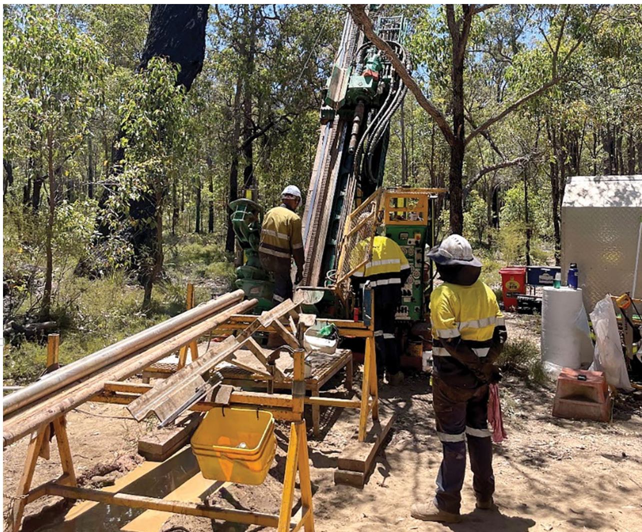
Figure 6: Diamond drilling in January-February 2023 at the East Kirup Lithium Prospect

Anomalies in the east and north showed that mineralisation was open to the east to the Thomas A prospect and further north. A sampling program commenced on the Thomas A area in February, in order to fully define the lithium anomalism. The assays of this partially completed program are pending.