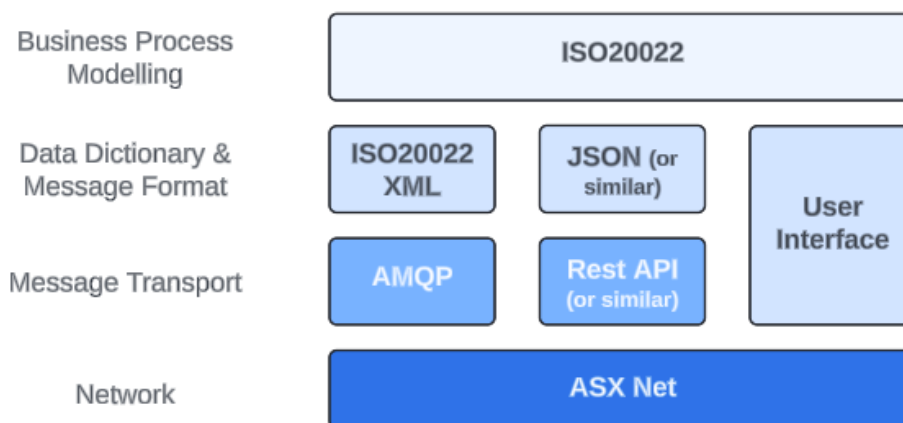
Diagram 2.0: Proposed data access interfaces

As a result of feedback received, ASX is considering the following industry design considerations for Release 2 of the CHES replacement project.